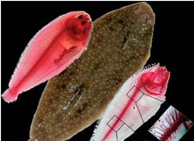
Skeletal abnormalities in sole

However, optimism perhaps should be tempered since a report of one experiment showed that although high density did not measurably depress growth rate, there was a detectable suppression of the immune system which would render the fish more susceptible to disease. In a separate paper, evidence was also presented that the stress of crowding brought changes in the composition of the amino acid pool. This led to the positive suggestion that dietary provision of certain amino acids might be a way of alleviating the effects of stress (see Disease section).