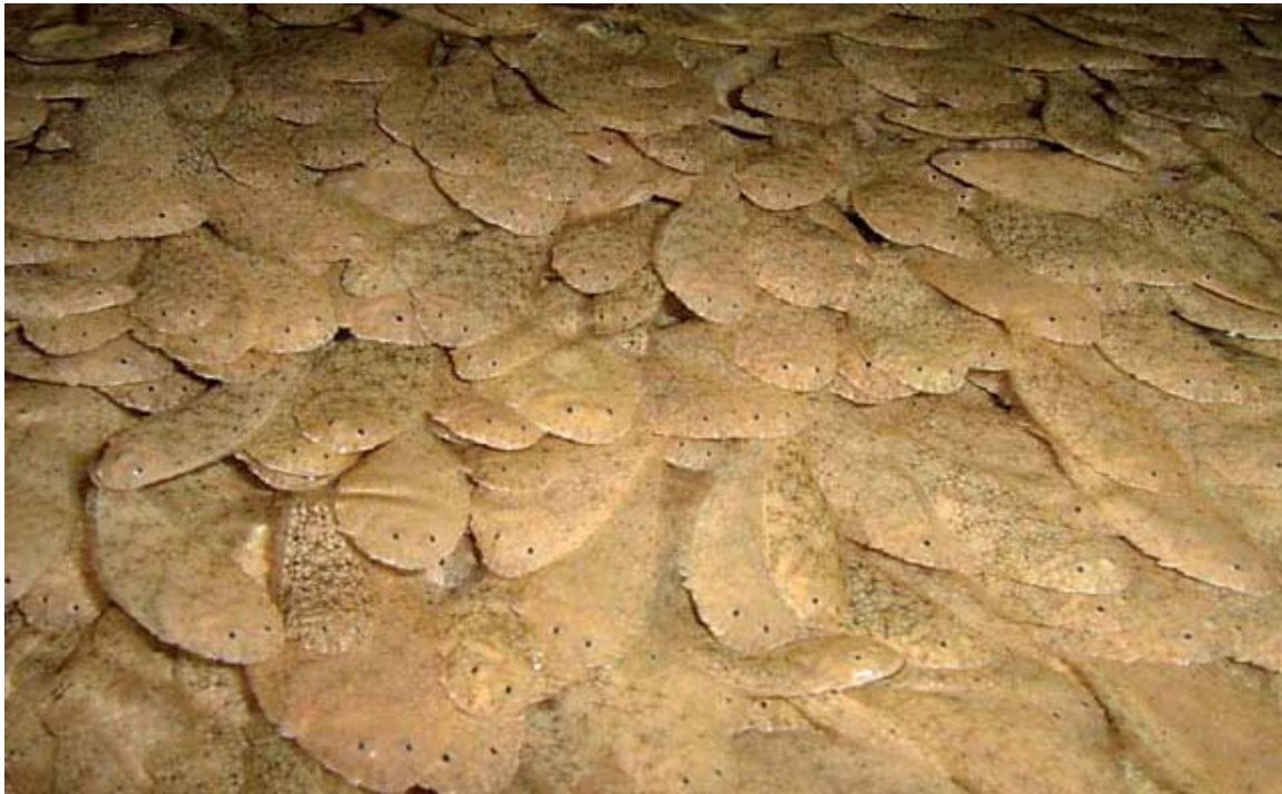
High density juveniles in a shallow raceway at a farm (A. Coelho & Castro) in northern Portugal.