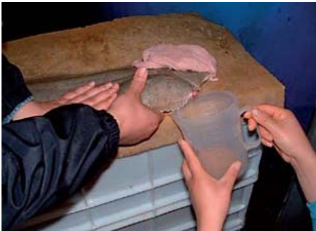
Stripping eggs from Senegal sole in China