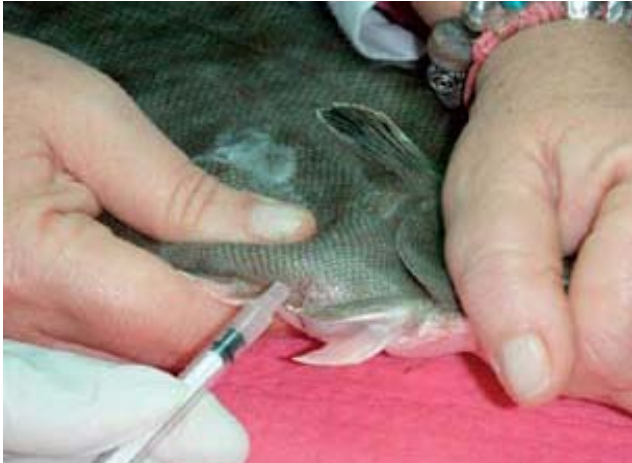
HCG-induced spermiation

these anomalies. In the meantime, progress on hormone therapies is enabling the achievement of artificial fertilization. In China, a notable achievement has been the application of such techniques on a commercial scale.