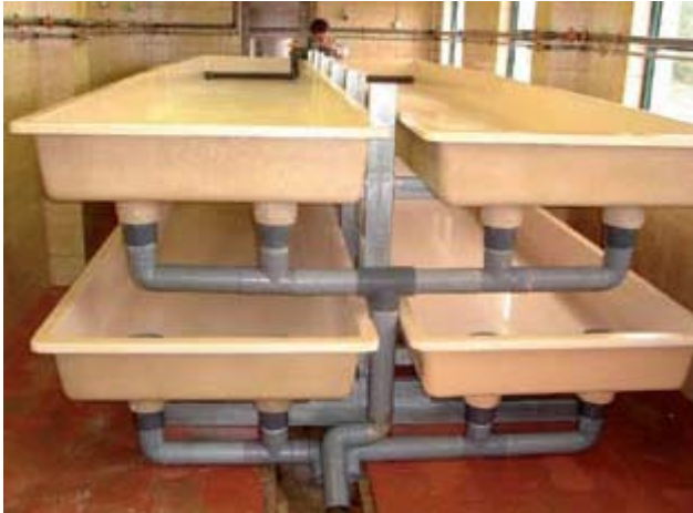
A trial version of a shallow raceway systems at a farm (A. Coelho & Castro) in northern Portugal.

The Workshop aimed to bring researchers and operators together to evaluate the current status and future needs of the sole farming industry while providing an opportunity for the exchange of information and discussion of major issues.