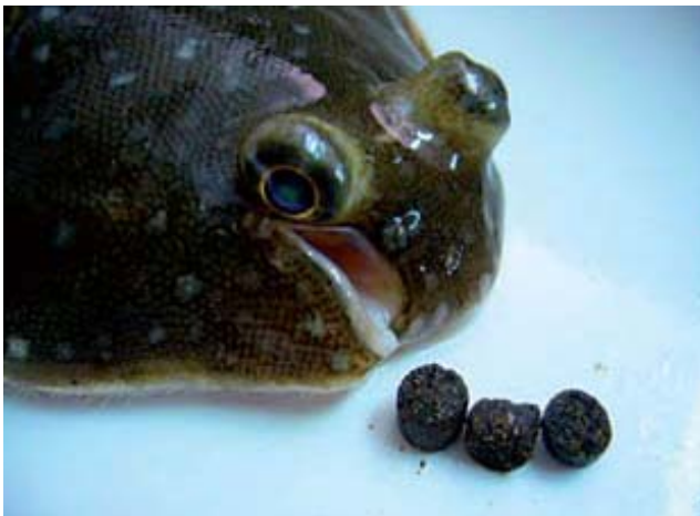
Sole pellets

It was reported that natural foods, such as worms and mussel-based diets, still outperform dry diets with respect to growth and food conversion efficiency. These nocturnal species adapt well, however, to diurnal feeding regimes at least as far as growth is concerned.