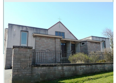
Our Lady of Lourdes Church, Dunfermline