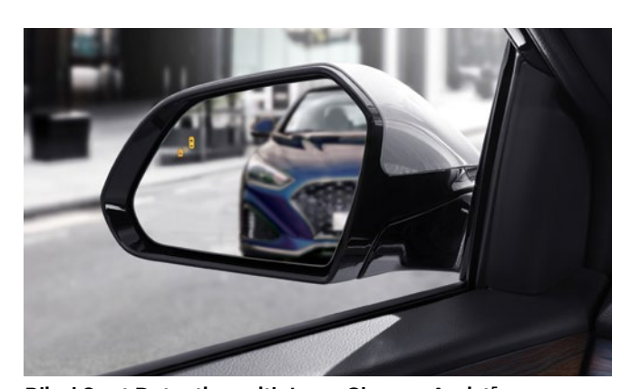
Blind Spot Detection with Lane Change Assist<sup>5</sup>

The available Driver Attention Alert (DAA) feature raises safety and convenience to an entirely new level by continuously monitoring and analyzing driving patterns. When a pattern of fatigue or distraction is identified, DAA gets the driver's attention with an audible alert and pop-up message suggesting a break.