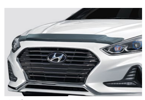
Plastic Hood Protector

This multimedia device holder allows your backseat passengers to have in-seat entertainment using a mobile phone or a tablet device. Features 360° rotation to allow use in portrait or landscape layout, hands free. The included mounting bracket easily fits to the headrest and the device holder is removable when not in use.