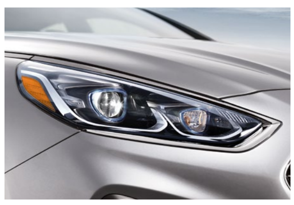
Available LED headlights

The redesigned details of the Sonata Hybrid and Plug-in Hybrid are not only striking, but also an example of brilliant aerodynamics. Key features include active air flaps in the new cascading grille that dynamically adjust to driving conditions, opening to allow greater airflow for engine cooling in stop-and-go traffic and then closing for better aerodynamics at sustained cruising speeds. The re-sculpted front and rear bumpers further contribute to reduced drag, and integrated wheel air curtains help direct air over and around the front wheels to minimize wind resistance — all for a smoother ride and greater fuel efficiency.