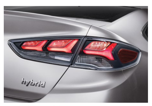
Standard LED tail lights