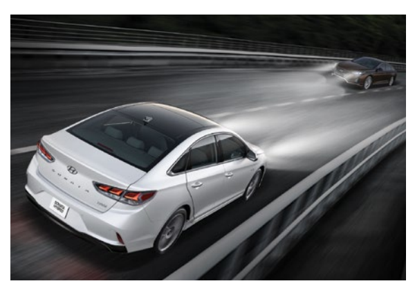
Available High Beam Assist