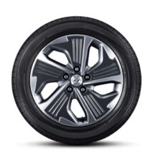
17" alloy wheels Standard on Hybrid GLS, Limited and Plug-in Hybrid Limited