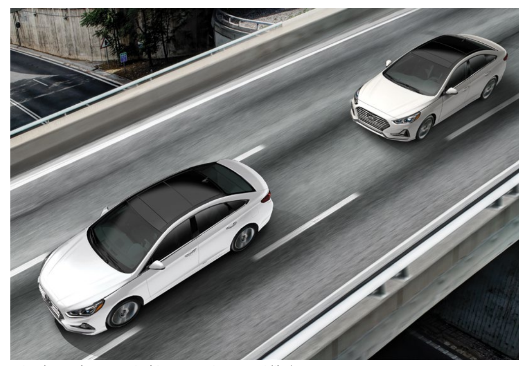
Adaptive Cruise Control with stop-and-go capability<sup>1</sup>

The available Adaptive Cruise Control (ACC) system takes basic cruise control to the next level of convenience. Set your pre-determined speed and distance to the vehicle ahead, and ACC will automatically adjust the vehicle speed to maintain the set distance. The system will even operate in stop-and-go traffic, bringing the vehicle to a complete stop when necessary and then resuming automatically.