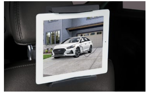
Multimedia Device Holder

Keep the inside of your car warm in winter months without using a drop of fuel! The Hyundai WarmUp System includes an interior cabin heater and a fully programmable display unit as well as an integrated battery charger.