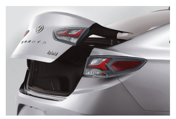
Standard hands-free Smart Trunk