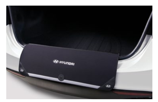
Trunk Lip Protector

Help protect the paintwork on your rear bumper from scuffs and scrapes when loading and unloading cargo.