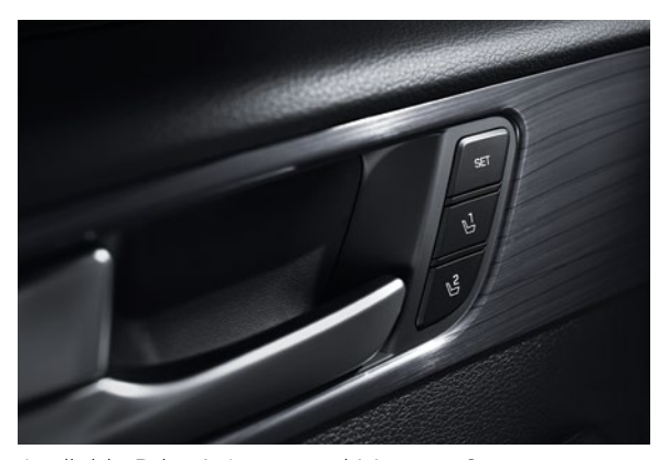
Available Driver's Integrated Memory System