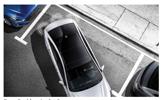
Rear Parking Assist Sensors

Activated during reverse driving, the standard Rear Cross-Traffic Alert system uses radar to help identify and warn the driver of vehicles approaching from the side, even before they come into the view of the standard rearview camera.