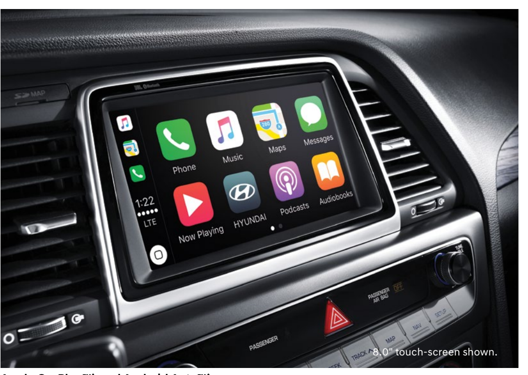
Apple CarPlay<sup>™∆</sup> and Android Auto<sup>™◊</sup>

The available Adaptive Cruise Control (ACC) system takes basic cruise control to the next level of convenience. Set your pre-determined speed and distance to the vehicle ahead, and ACC will automatically adjust the vehicle speed to maintain the set distance. The system will even operate in stop-and-go traffic, bringing the vehicle to a complete stop when necessary and then resuming automatically.