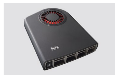
Hyundai WarmUp System

Premium all weather floor liners were designed to cover the interior carpet providing maximum protection against the elements that other mats cannot offer. Their unique and durable design features a non-slip surface for added comfort and a long lasting premium look. Remove carpet mats prior to installation.