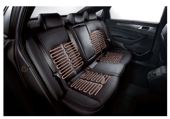
Available heated rear seats