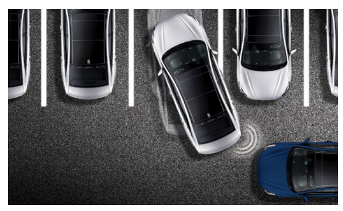
Rear Cross-Traffic Alert<sup>6</sup>

The standard Blind Spot Detection (BSD) system uses radar to detect when a vehicle is in the driver's blind spot and provides both an audible and visual alert to help keep you aware as you move down the road. Working in conjunction with BSD, Lane Change Assist measures the closing speed of traffic approaching in adjacent lanes to help determine if a lane change is safe.