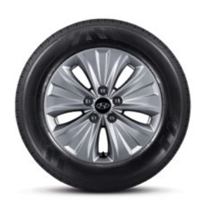
16" alloy wheels Standard on Hybrid GL