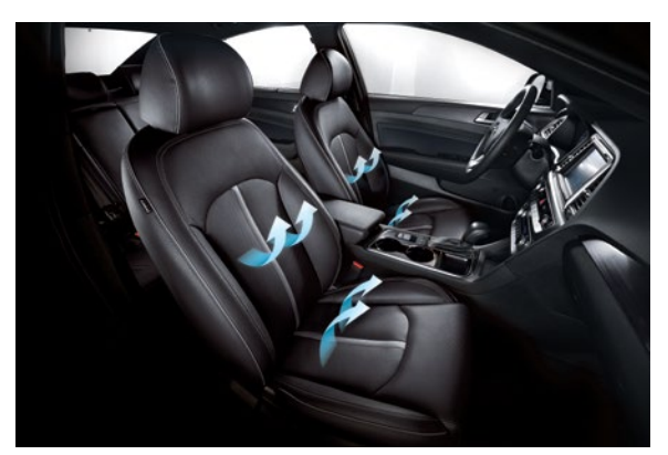
Standard heated front seats and available ventilated front seats