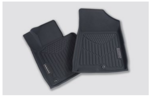
Premium All Weather Floor Liners

Help protect the paintwork on your rear bumper from scuffs and scrapes when loading and unloading cargo.