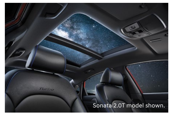
Available panoramic sunroof

The ergonomic and driver-oriented cabin is intuitively laid out for comfort and convenience. Consider the revised centre console that is optimally positioned to help you keep your eyes on the road, or the steering wheel-mounted controls that are grouped by function for simpler interaction.