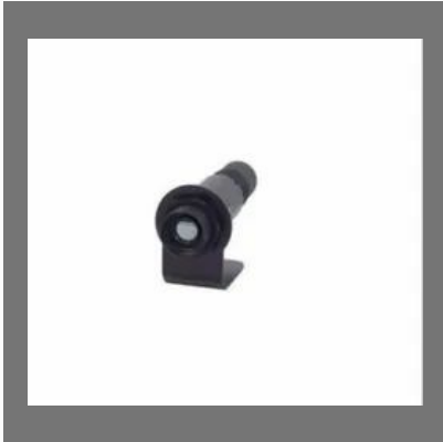
Raytek Thermalert Tx Infrared Temperature Sensor , -18 to 2000 DegC