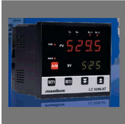
Masibus - LC5296-AT Auto-Tune PID Controller