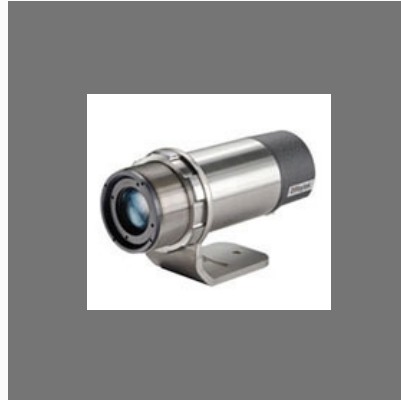
Raytek Marathon Mm Infrared Temperature Sensors, 40 to 125 Deg C