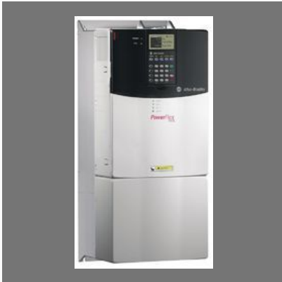
Industrial AC Drive