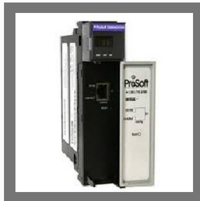
Prosoft: Modbus TCP/IP Client/Server : MVI56E-MNET