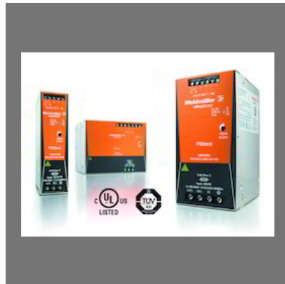
Weidmuller Power Supply