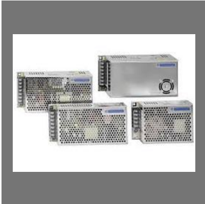
Schneider Power supply - Flat Type SMPS