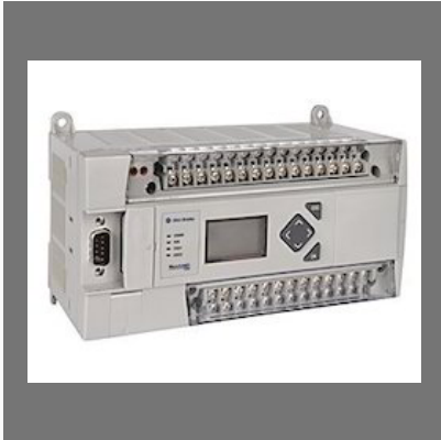
Micro Logix System