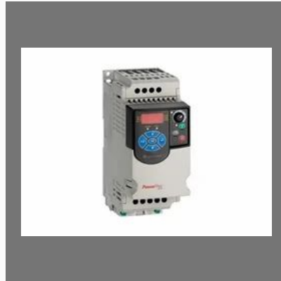
Industrial AC Drive