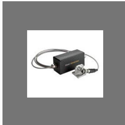
Raytek Marathon FA Infrared Sensors