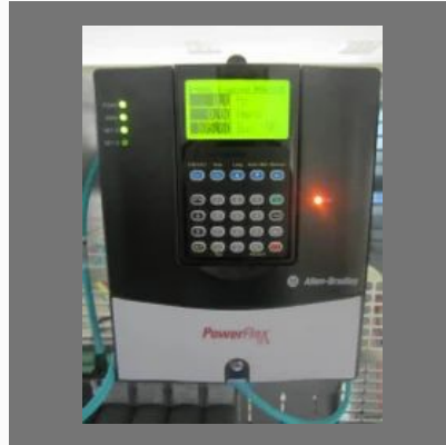
Industrial AC Drive