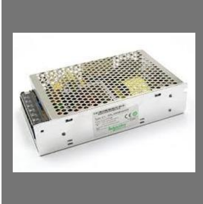
Schneider Power supply Flat Type SMPS