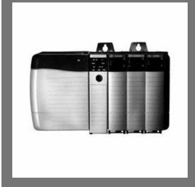
Control Logix Control System