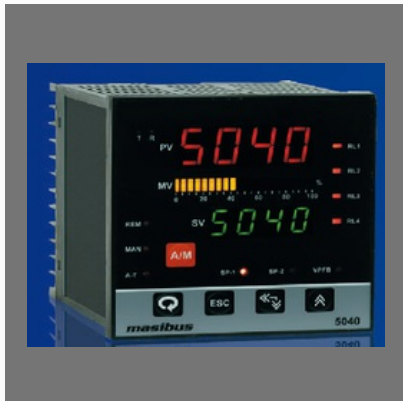
PID Single Loop Controller