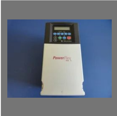
Industrial AC Drive