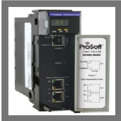
Prosoft : Enhanced Modbus Master/Slave Communications: MVI56E-MCMR