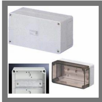
Polycarbonate Terminal Boxes