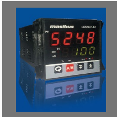
Masibus - LC5248L-AT/LC5248E-AT Auto-Tune Controllers