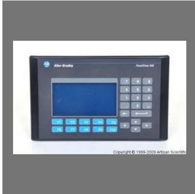
Panelview Plus 400