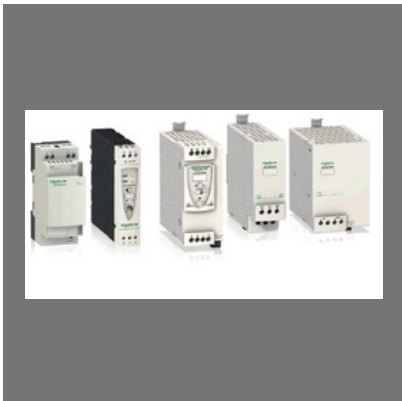
Power Supply Schneider