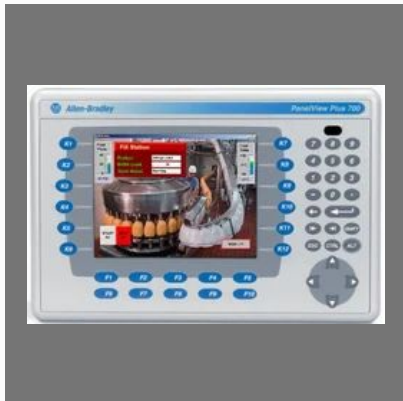
PanelView Plus CE 700 HMI Drive