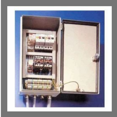
EB E Box Rittal Panel