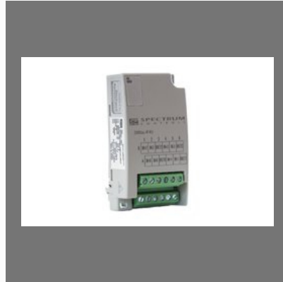
Micro800 Access Control System