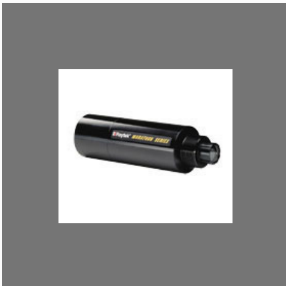
Raytek Marathon Mr Infrared Sensor (for Harsh Environments)