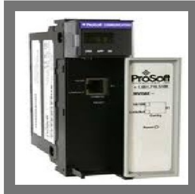
Prosoft : Modbus TCP/IP Client/Server : MVI56E-MNETR