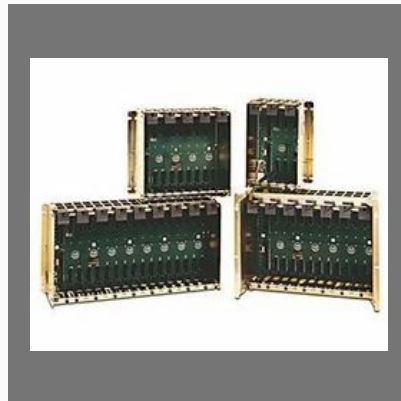
PLC-5 Control System