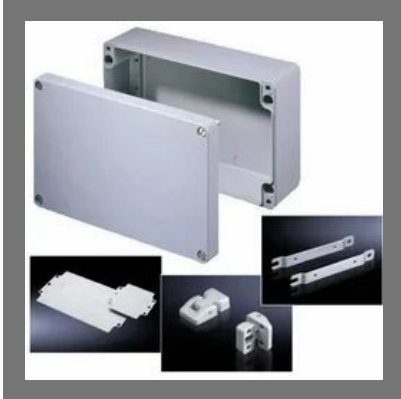
GA Cast Aluminium Enclosures