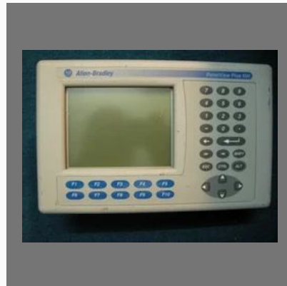
Panelview Plus 600