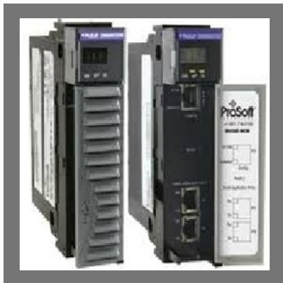
Prosoft : MVI56E-MCM :Modbus Master/Slave Communications