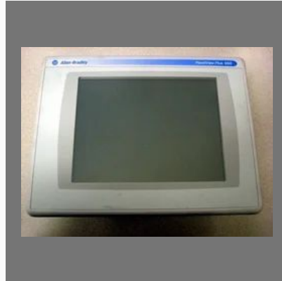
Panelview Plus 1000