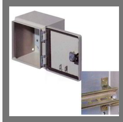
EB E Box Rittal Panel