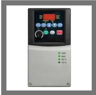
Industrial AC Drive