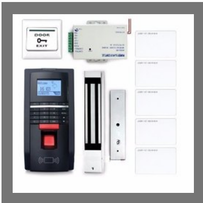
Pico Access Control System