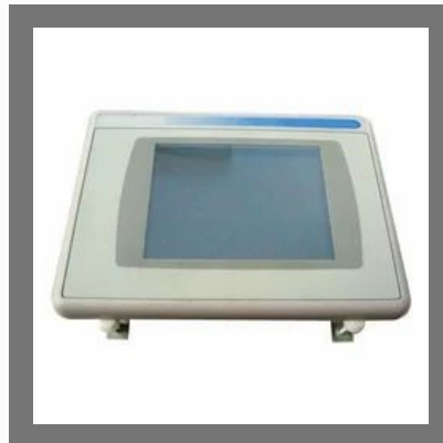
Panelview Plus 700