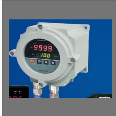
Masibus - LC5296-XP-AT Flame Proof Auto-Tune Controller