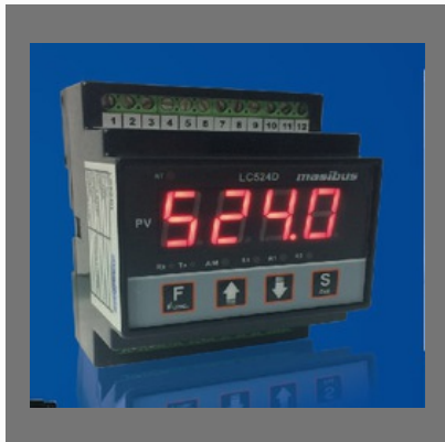
Masibus - LC524D Din Rail Auto-Tune Controller