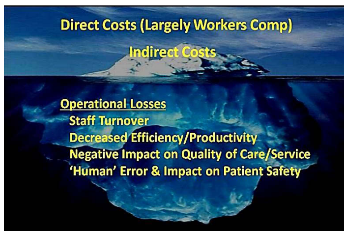
Figure 2.1 Full Costs of Workplace Injuries

To make an effective and ongoing business case that will result in a fully funded and sustainable WPV program, it is often necessary to identify all the costs and benefits of implementing such programs. This allows you to demonstrate a positive return on investment for the organization in terms of financial benefits and contribution to strategic organizational goals and clinical programs.