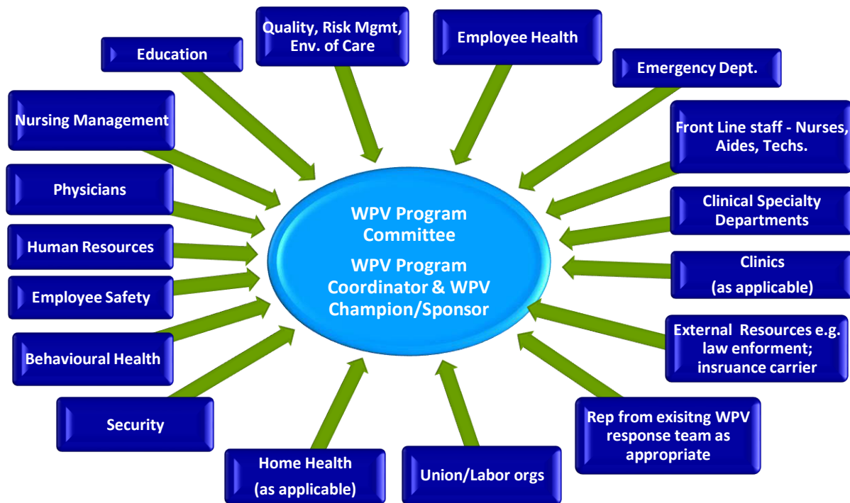
Figure 2.2 Example of WPV Committee Membership

Figure 2.2 , shows the stakeholders (i.e., disciplines, expertise and departments), that may be represented in a WPV committee at this stage of program planning stage.