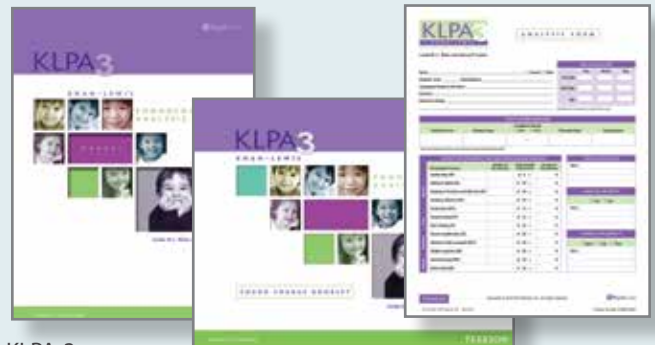
KLPA-3 English edition