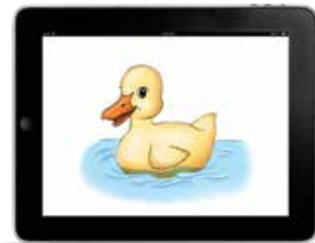
Client's iPad view on Q-interactive

Visit PearsonAssessments.com/GFTA3KLPA3 for more information