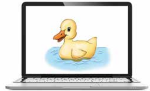
Client's laptop view

*KLPA-3 phonological analysis is not available for GFTA-3 Spanish.