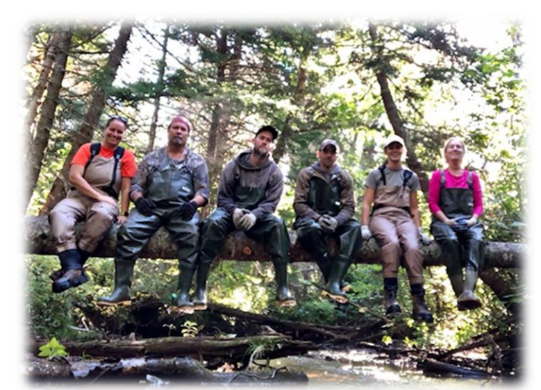
Above photo: Stream enhancement team in a Cross River stream extension. Below photo: Stream enhancement team at a large beaver dam in Bear River.

MacAskill's River was cleared from tidal to the Northside Road. This is a new stretch that had not been completed since 2011.