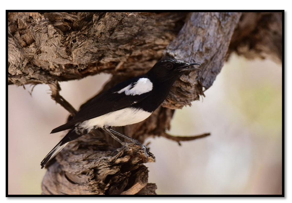
Day 5 By now we should be quite accustomed to our typical daily routine, and we'll be up fairly early in order to bird the nearby Goegap Nature Reserve where we hope to

locate Cinnamonbreasted Warbler and Karoo Eremomela, if we haven't yet done so. Other species we'll be looking for include Dusky Sunbird, Whitebacked Mousebird. Mountain Wheatear, Layard's Titbabbler and