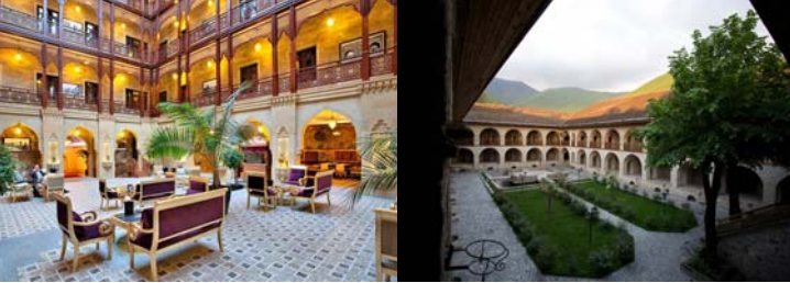
Traditional style in historic Baku

Accommodation: On this tour we offer an interesting selection of hotels ranging from the traditional to the modern. Boutiuge hotels with sufficient rooms for a small group are hard to find but we are sure you will not be disappointed. In Baku our hotel is located in the heart of the old walled city and offers wonderful Azerbaijani elegance. In Sheki we stay in an 18<sup>th</sup> Century caravanserai. It's basic with private facilities and it's wonderful. Our hotel in Tbilisi is modern and comfortable and well located. In the mountains in Gudauri we overnight in a mountain chalet and in Yerevan we stay in a wonderful hotel in the heart of the city.