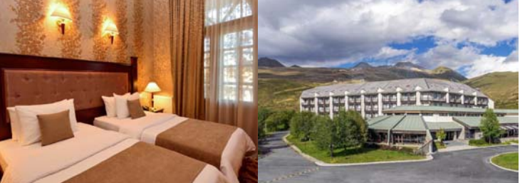
4 Star comfort in Tbilisi