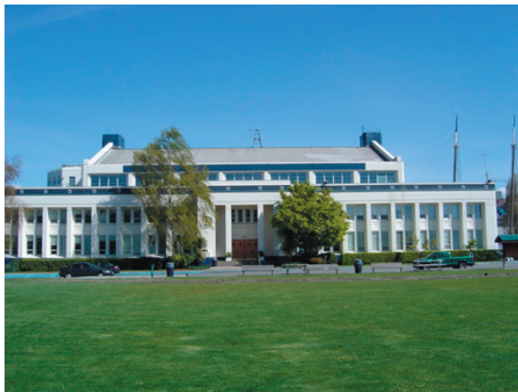
The Armory—a SLU landmark

Neighborhood identifiers can be businesses, banners, and other elements that use South Lake Union in their name. By using the neighborhood name in this way, it helps visitors know where they are and creates a better sense of identity for the residents. SLU only had a few examples of neighborhood identifiers. However, this is a relatively easy element to add into SLU as new businesses and events appear within its boundaries. The South Lake Union name can be added to street furniture as well.