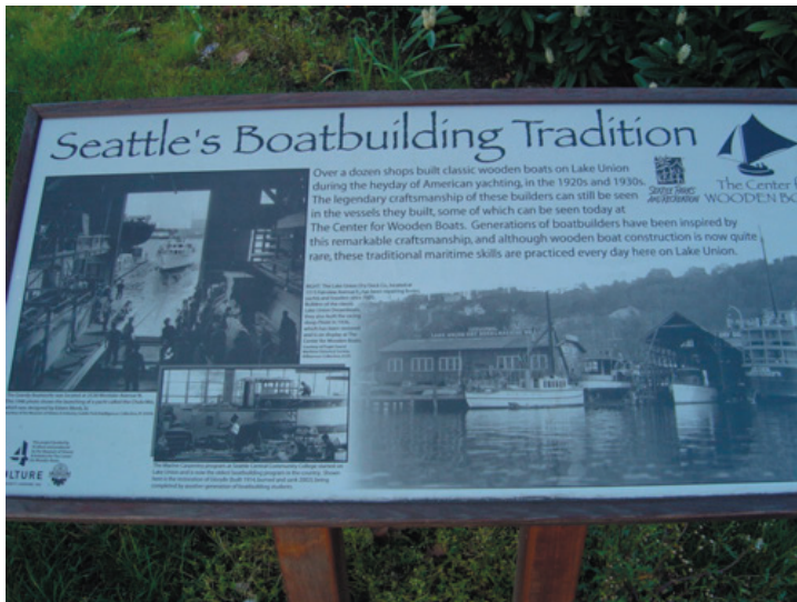
The Center for Wooden Boats is home to the Wawona and Swiftsure

Finally, sites around SLU could be featured on a regional Maritime History Trail that stretches around the greater Puget Sound area. Such a trail exists along the coast of New Jersey and is an effort to preserve maritime heritage in the region. The regional trail could include sites such as museums, light houses, state parks, marinas, monuments, historic sites and scenic overlooks. One group that could be responsible for this undertaking is the Task Force on Maritime Heritage sponsored by 4Culture (formerly the King County Office of Cultural Resources).