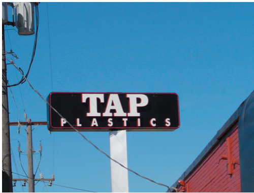
Rotating signs are landmarks that add a funky feel

Nodes of activity and transportation are important areas for neighborhood identity. These can be either inside the neighborhood boundary, or merely entrances to South Lake Union. The Urban Form team of Winter Quarter 2004-2005 found a variety of nodes within the neighborhood, as noted on the map of entrances. Important entrances include where Fairview, Eastlake, and Westlake enter SLU from the east. Once the streetcar line begins its route, Terry Avenue will be another significant entry. Nodes within South Lake Union include where Broad Street meets Valley Street, where Fairview Avenue meets Valley Street, where Fairview meets Mercer, and both Denny and Cascade Parks.