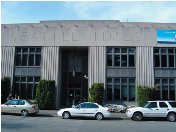
Seattle Times—architectural landmark