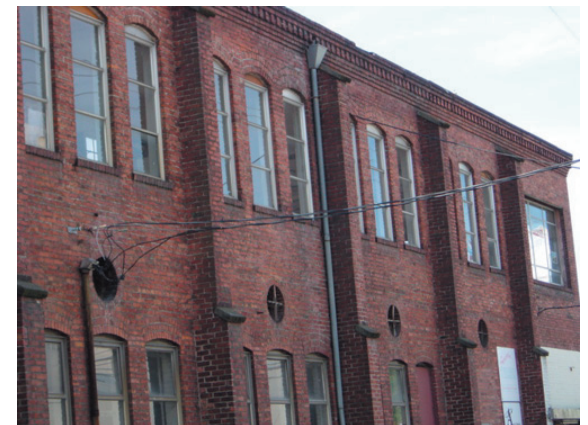
Historic warehouse building

Both World Wars led to further industrialization of the area. Warehouse buildings became common (often replacing aging residential structures), and auto-oriented businesses and showrooms emerged. The Seattle Times moved into the area as well. The lake was used heavily in the war effort for ship-building and new Naval training facilities