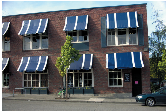
Streetscape details add to neighborhood identity