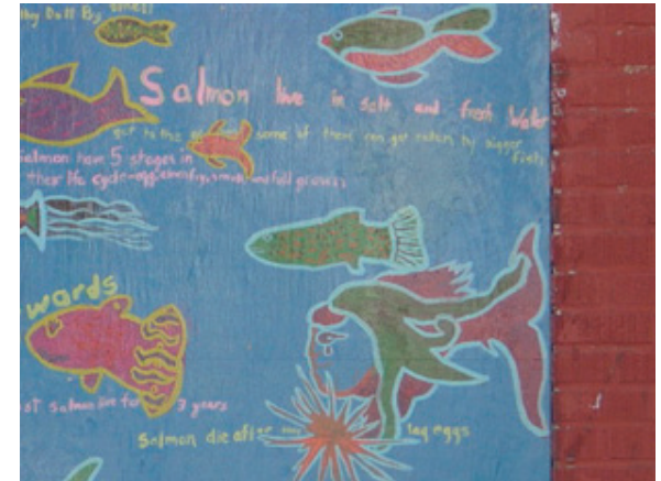
Children's art outside of a SLU private school

Research focused on locating neighborhood themes and identifiers, significant architecture, important nodes of activity, street furniture, and public art. Thematic elements are found throughout a neighborhood without actually using the name South Lake Union. Seattle examples would include the Chinatown/International District dragons or Pioneer Square’s historic lamp posts. Other examples include special sidewalk material and artwork on buildings or bus stops (Photos by Catherine McCoy, 2005).