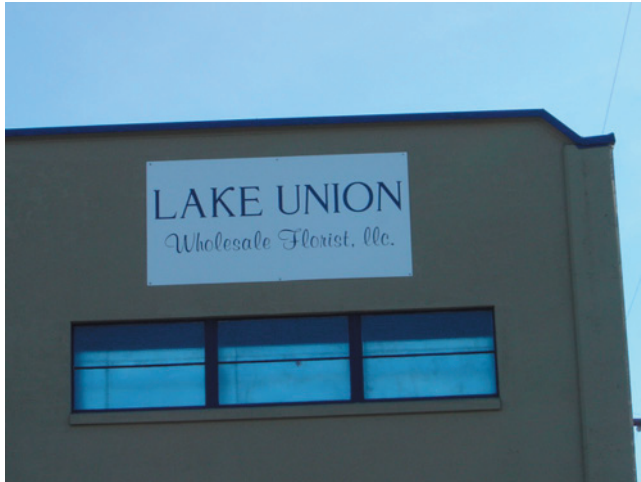
SLU business that uses the location in its name

Neighborhood identifiers can be businesses, banners, and other elements that use South Lake Union in their name. By using the neighborhood name in this way, it helps visitors know where they are and creates a better sense of identity for the residents. SLU only had a few examples of neighborhood identifiers. However, this is a relatively easy element to add into SLU as new businesses and events appear within its boundaries. The South Lake Union name can be added to street furniture as well.