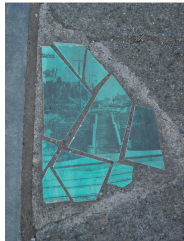
Historic sidewalk mosaics

From this brief overview of SLU history, major themes and issues can be identified. Issues include connectivity, revitalization and environmental care. Themes that are applicable to the community identity/branding process are industry, maritime and diversity.