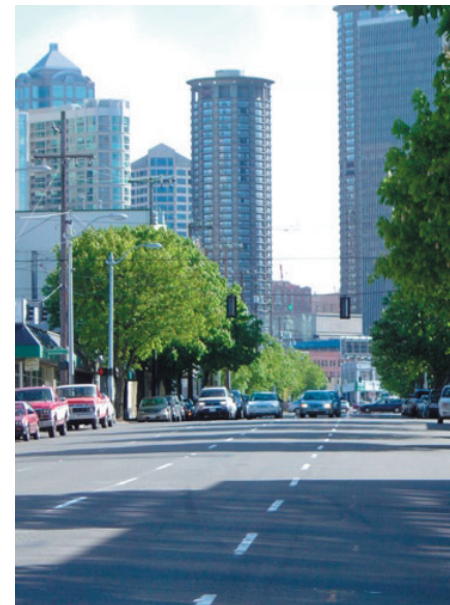
Cars enter SLU on Westlake