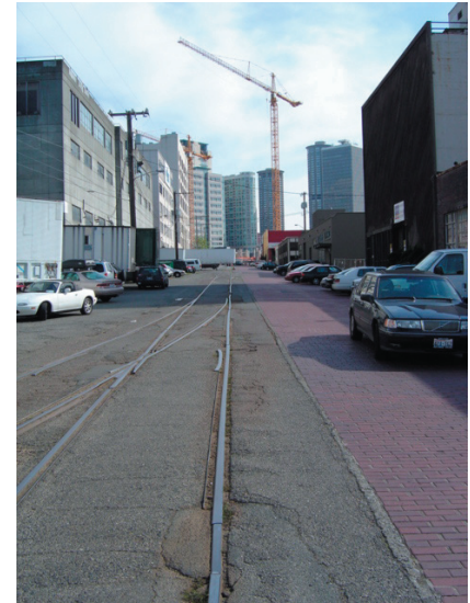
Terry Avenue will be much different with a streetcar

Nodes of activity and transportation are important areas for neighborhood identity. These can be either inside the neighborhood boundary, or merely entrances to South Lake Union. The Urban Form team of Winter Quarter 2004-2005 found a variety of nodes within the neighborhood, as noted on the map of entrances. Important entrances include where Fairview, Eastlake, and Westlake enter SLU from the east. Once the streetcar line begins its route, Terry Avenue will be another significant entry. Nodes within South Lake Union include where Broad Street meets Valley Street, where Fairview Avenue meets Valley Street, where Fairview meets Mercer, and both Denny and Cascade Parks.