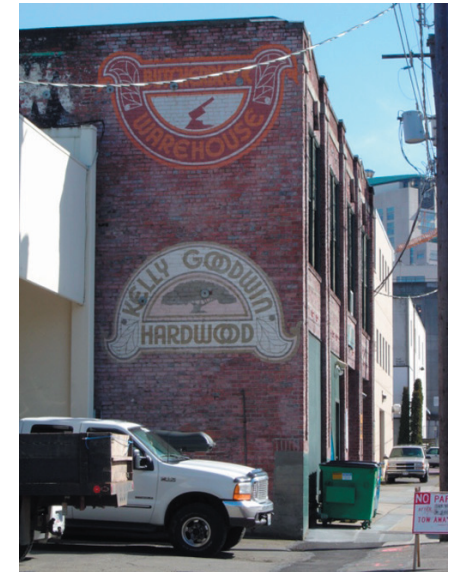
Historic laundry in SLU

Architectural elements can include historic or unique buildings as well as streetscape design and landmarks. In SLU, there are many great buildings that made the neighborhood stand out from others close-by. The overall streetscape design needs improvements to re-orient roads to the