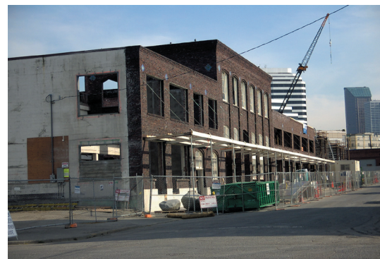
Incorporating an historic façade in a new development

new developments that hold biotech firms, apartments, and retail. Since the neighborhood plan states that the residents would like SLU to retain its texture and mixed-use variety, it is important to recognize the value of the built environment already in place, and to create new buildings that fit into the neighborhood context.