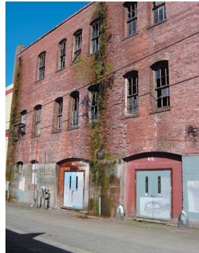
Historic building with SLU character

pedestrian, but new design guidelines address this issue. Besides the historic buildings, some places are highly visible, such as the Cascade area with its sustainable feel, and eclectic businesses like Jones Soda, Taco del Mar and Kapow! Coffee. Others include galleries such as Consolidated Works and COCA, and