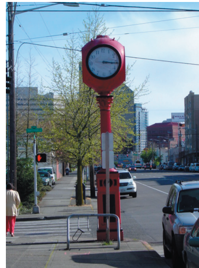
Street furniture as landmark

Within SLU, several themes were observed. Local business clusters can be important elements of a neighborhood identity. Noted clusters included furniture stores and warehouses, wholesale florists, art galleries, and maritime businesses. The furniture cluster seemed especially dominant within South Lake Union, which sparked an idea for a flea market to add to the neighborhood identity and to appeal to tourists. Other thematic elements included historical sidewalk tiles, historic buildings and murals, and the industrial character of the neighborhood. Biotechnology may be a theme of the future for the area if more of these businesses are attracted to the area.