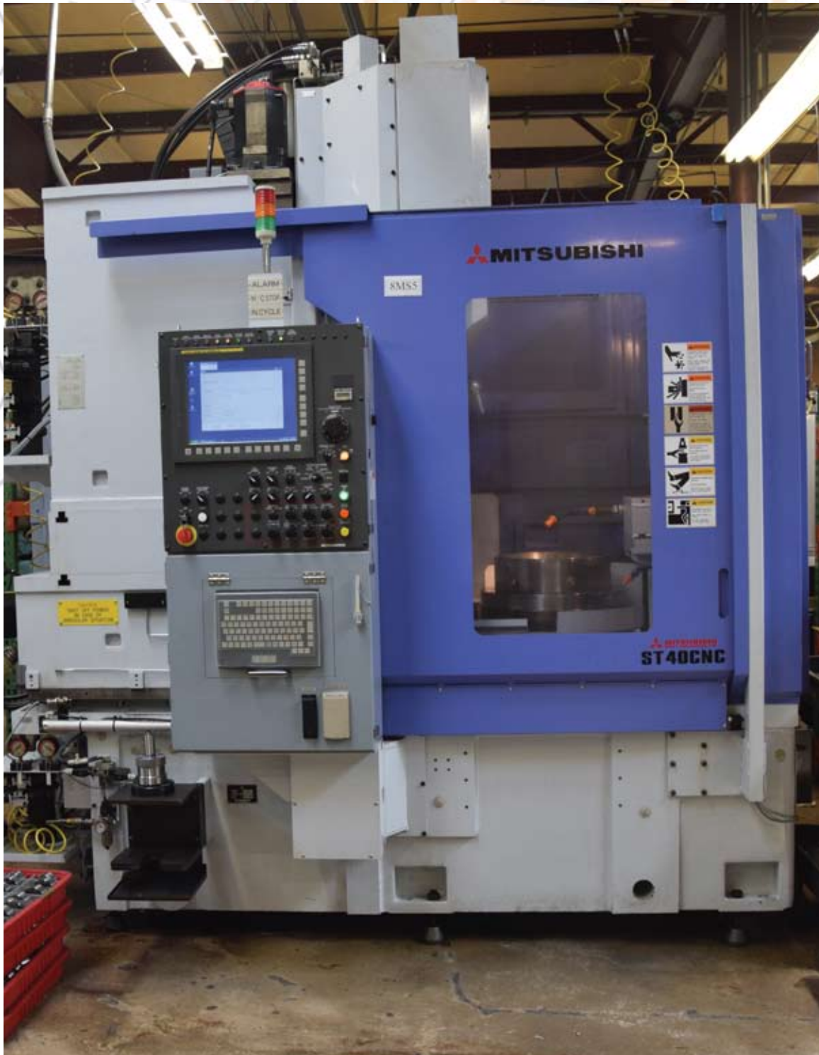
MITSUBISHI ST40 CNC GEAR SHAPER