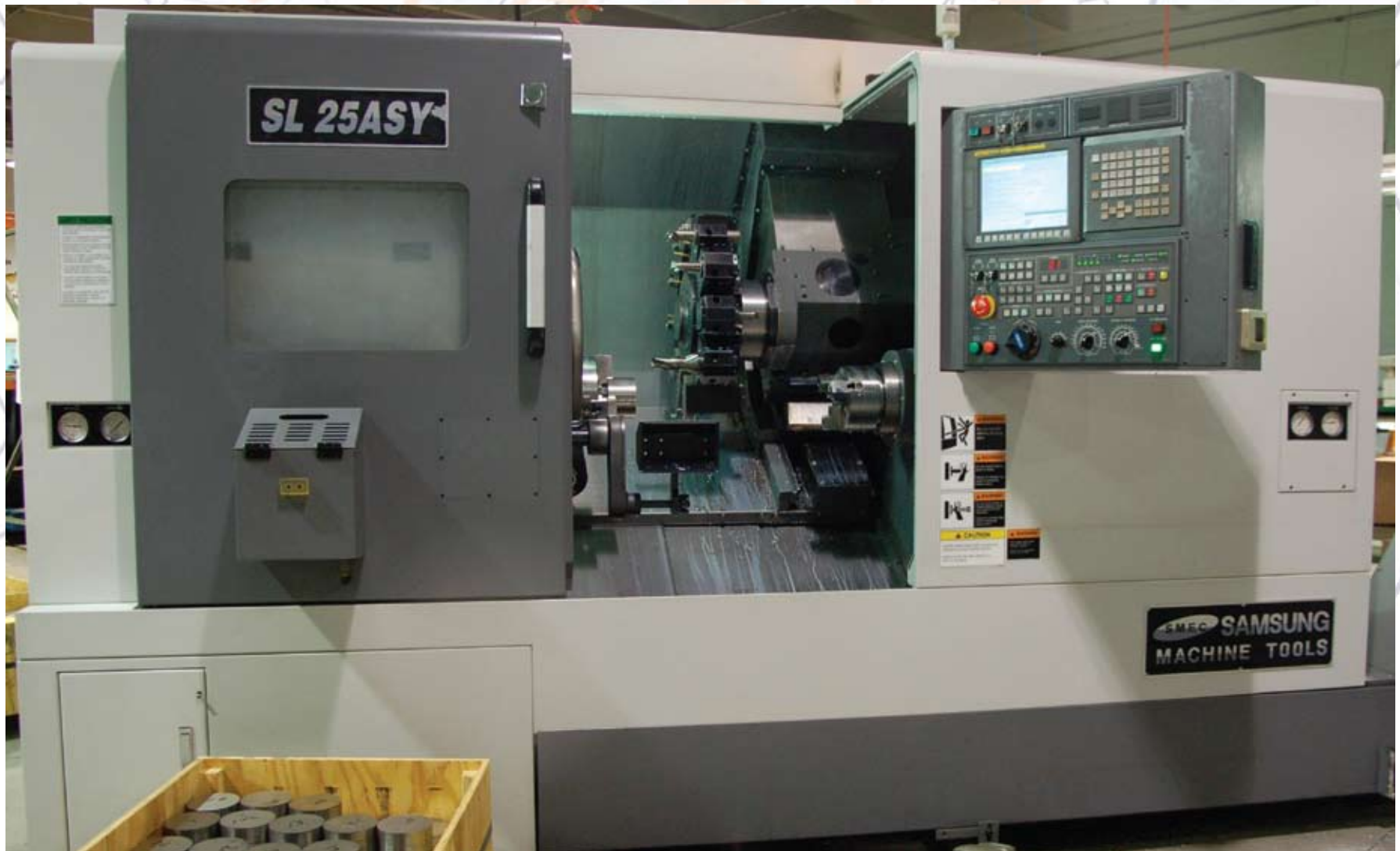
SAMSUNG SL25 ASY CNC LATHE WITH LIVE TOOLING 8" Chuck