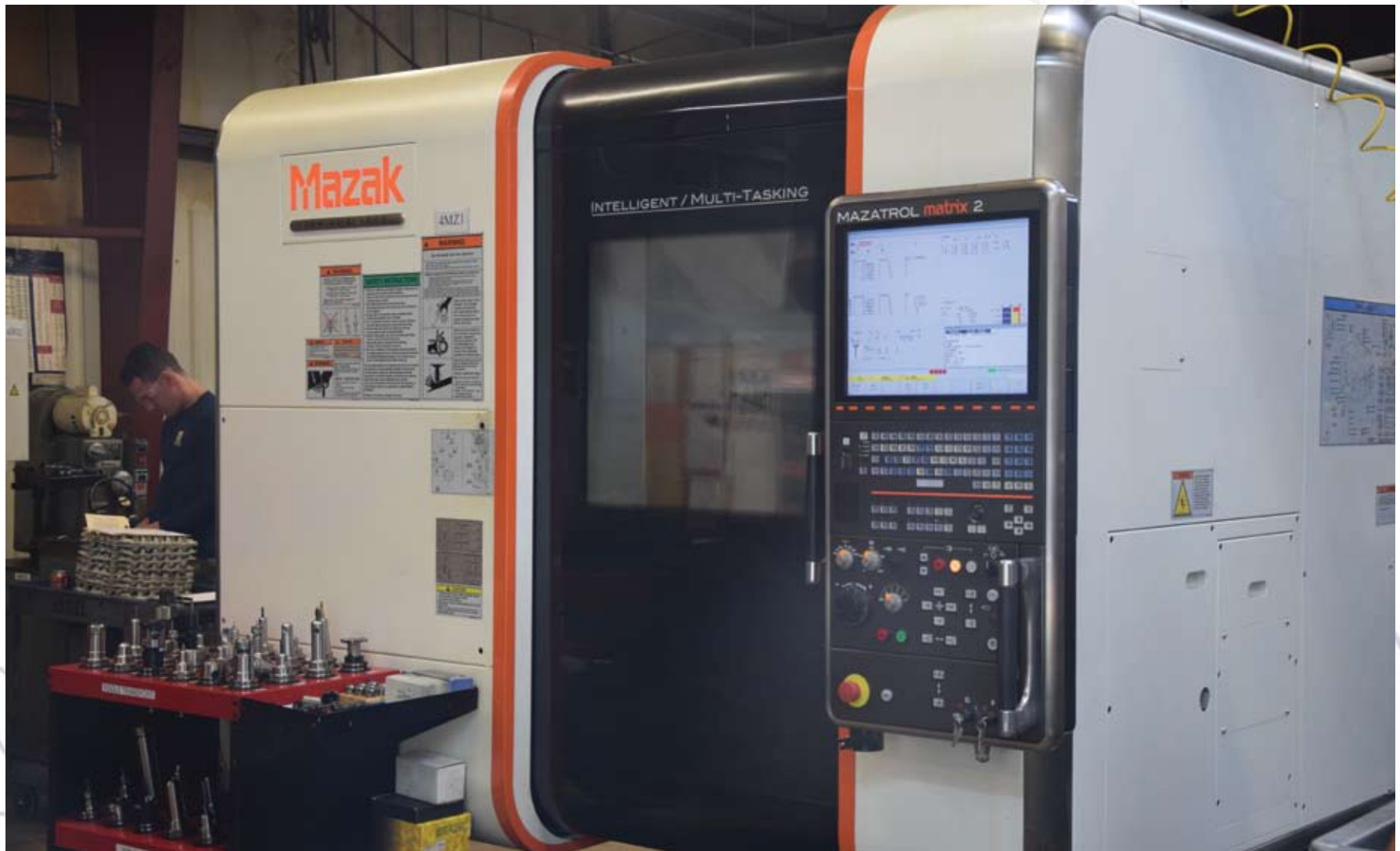
MAZAK VARIAXIS i-500 5 AXIS CNC MILLING MACHINE