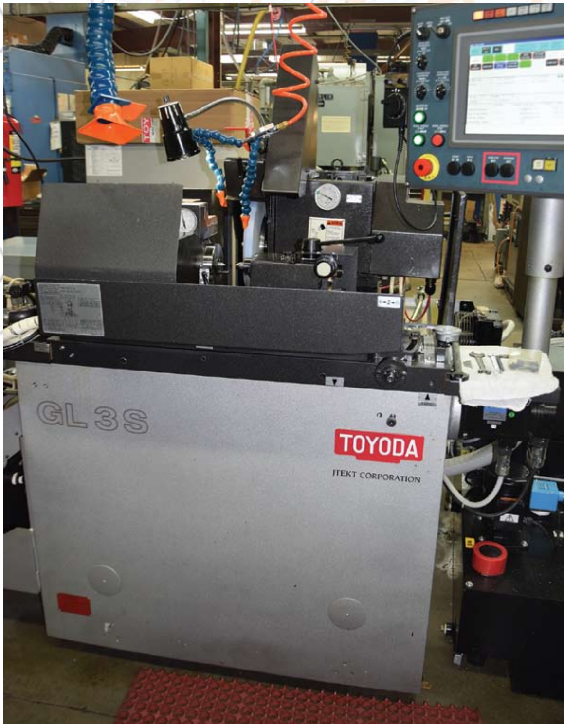
TOYODA GL3S CNC O.D. GRINDER