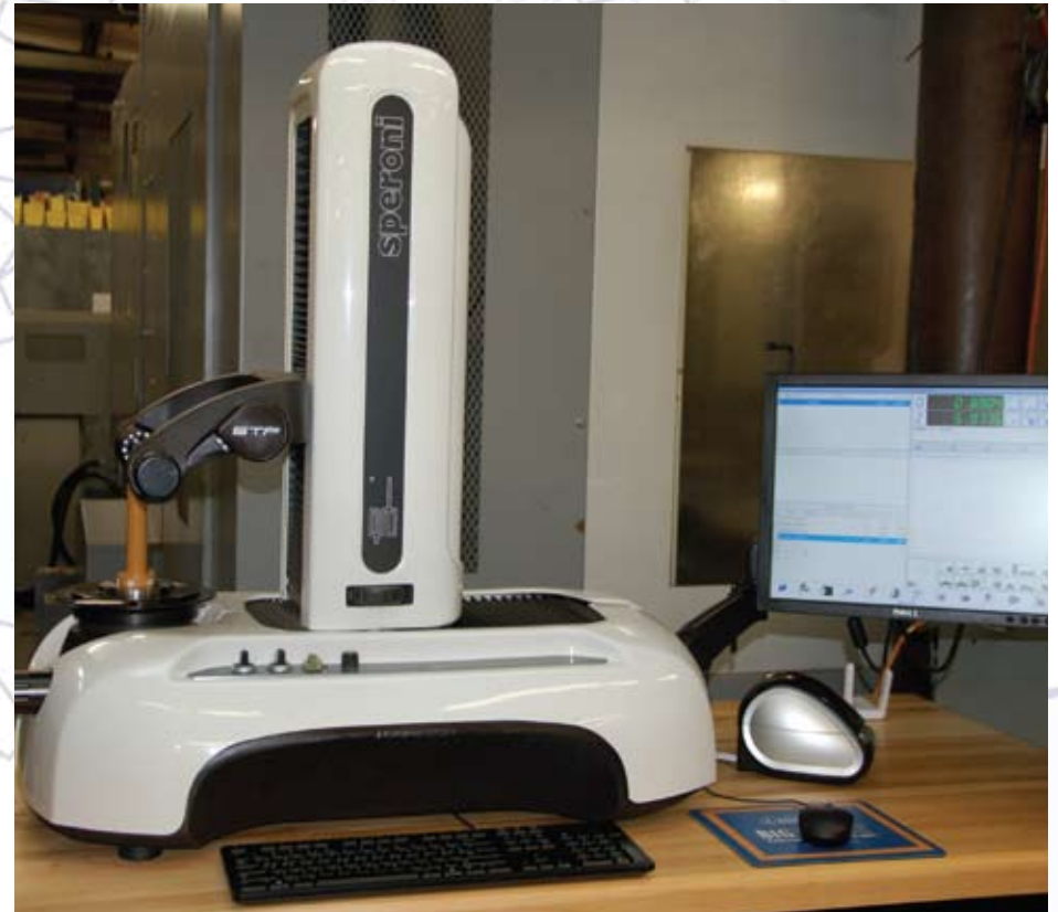
SPERONI MAGIS400 TOOL SETTER