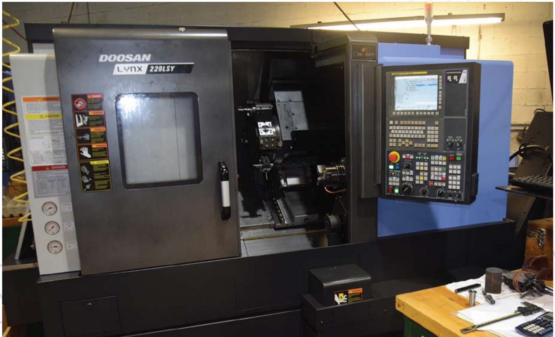
DOOSAN LYNX 220 LSYC