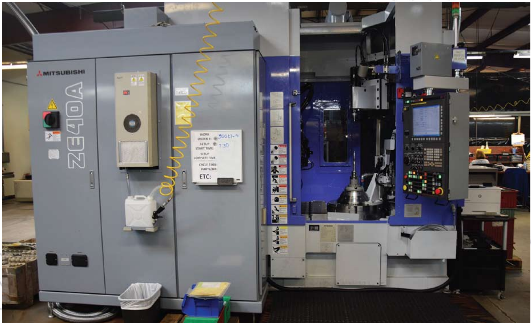
MITSUBISHI ZE40A PROFILE AND THREADED WHEEL GRINDER