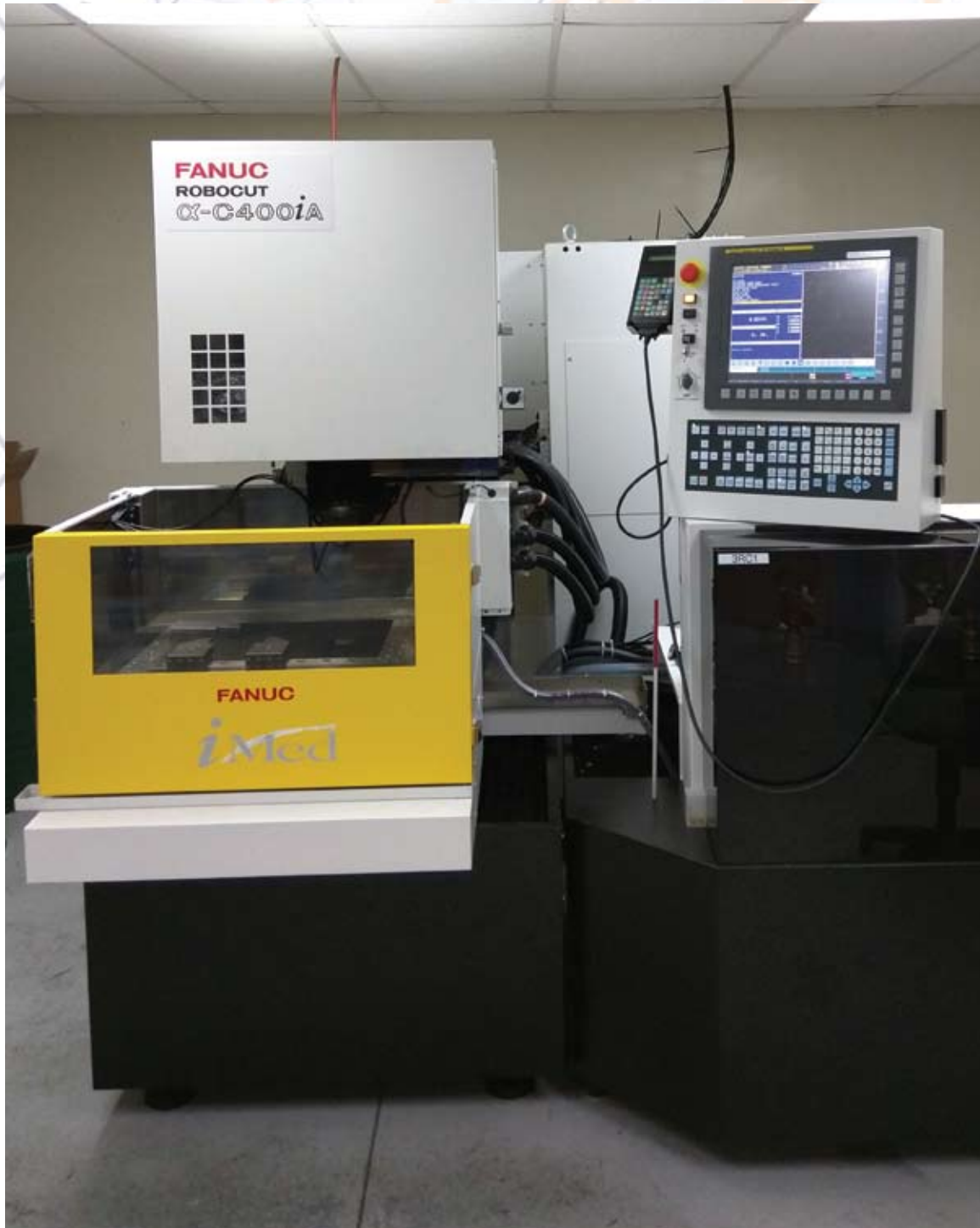
FANUC ROBOCUT MODEL C400iA EDM MACHINE