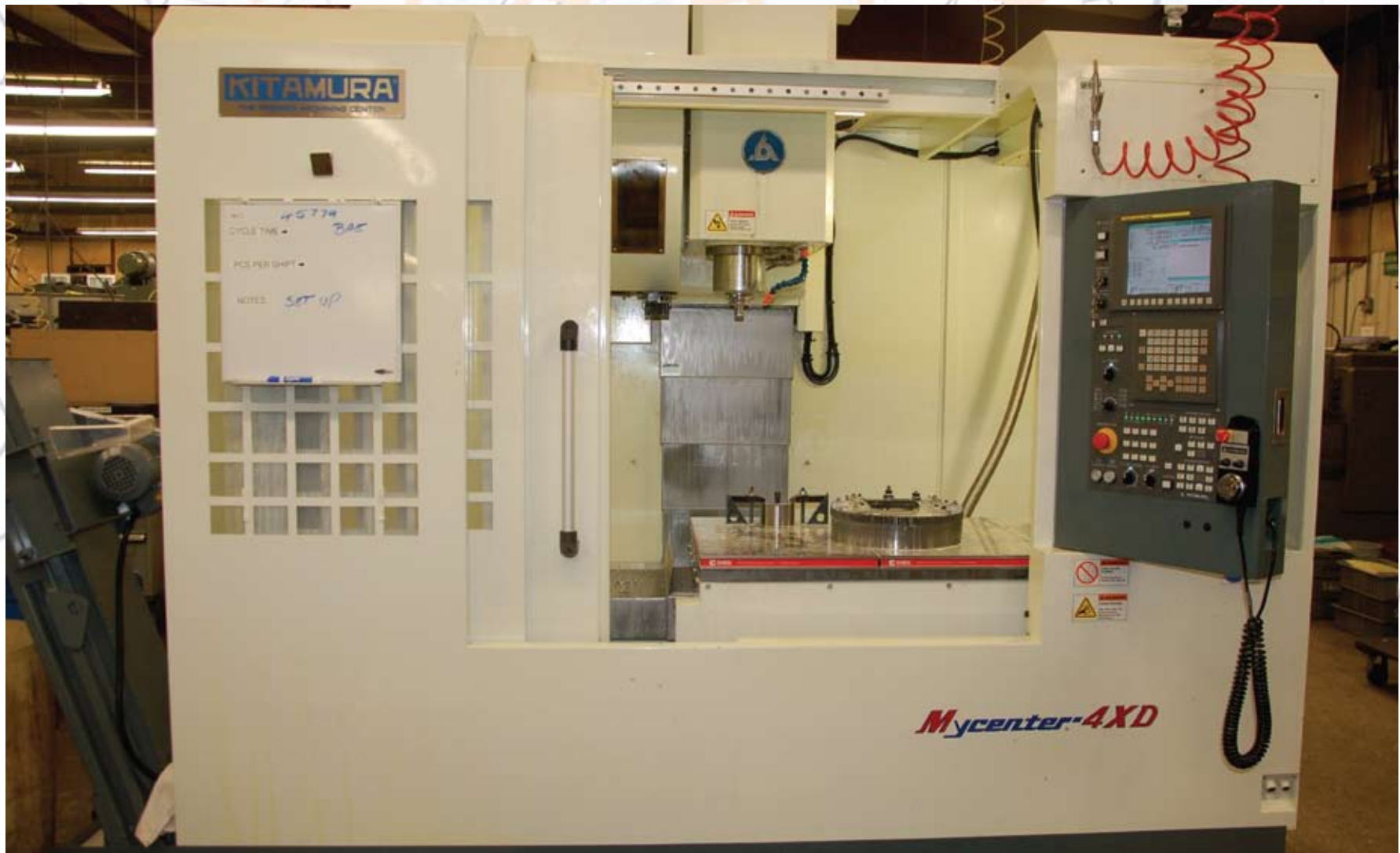
KITAMURA MYCENTER 4XD CNC MILLING MACHINE