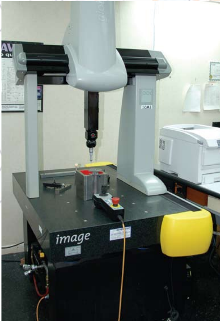
BROWN & SHARPE CNC Co-ORDINATE MEASURING MACHINE WITH PC DEMIS SOFTWARE