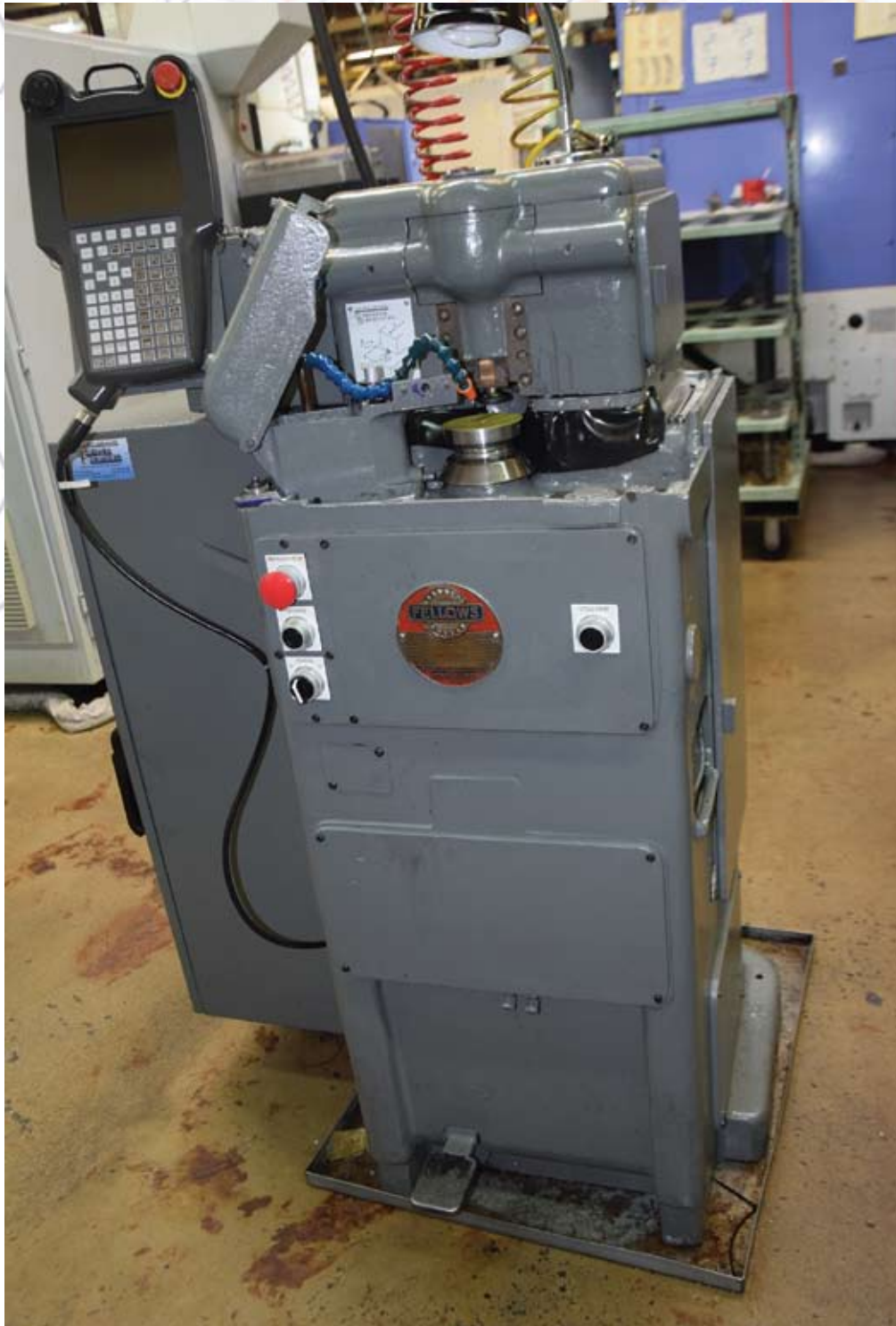
FELLOWS #3 FANUC CNC GEAR SHAPER