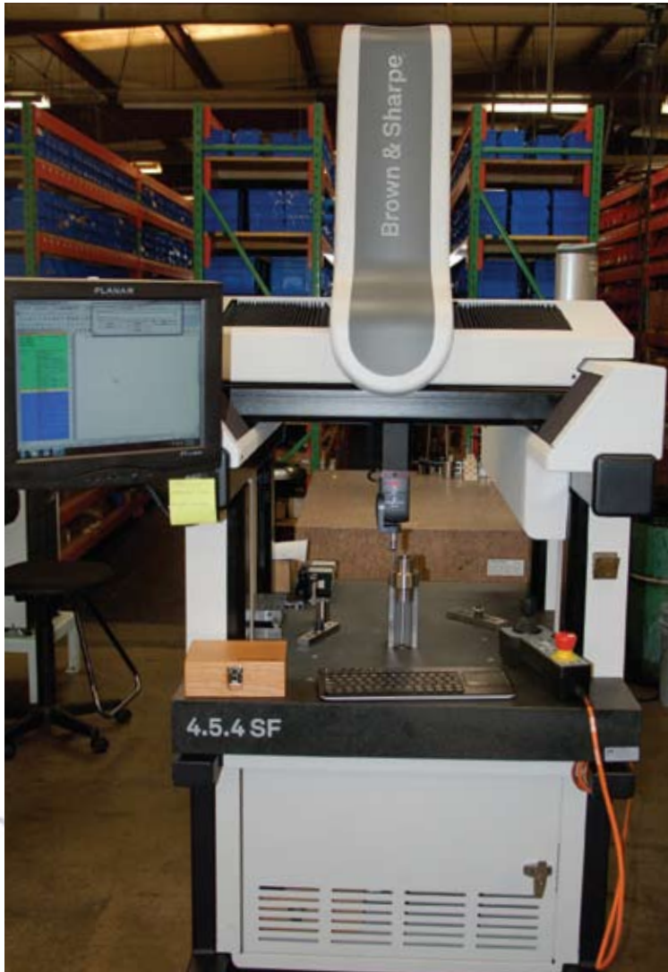
BROWN & SHARPE SF 454 CMM