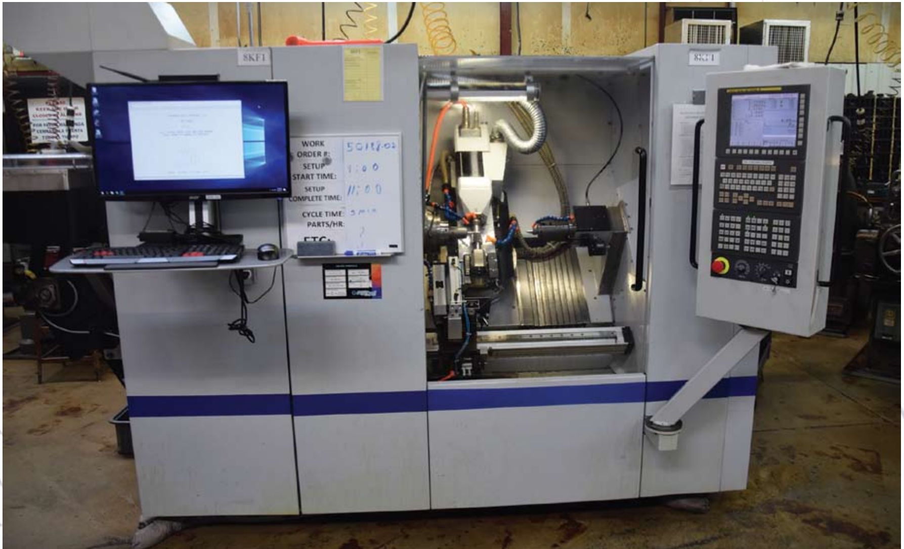
KOEPFER 160 CNC GEAR HOBBER