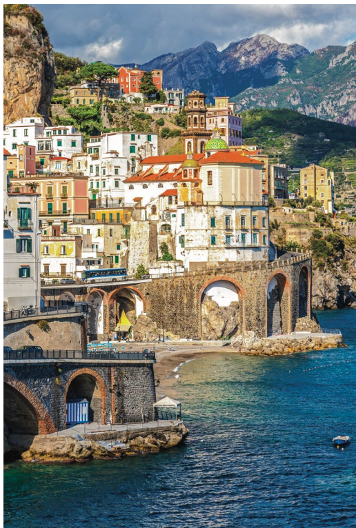
Stunning Amalfi Coast