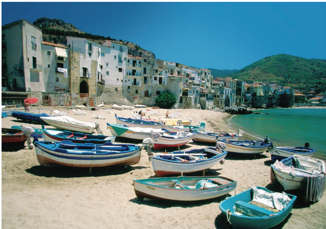
Colorful fishing boats along a Sicilian harbor

Day 6: Taormina/Matera We leave Sicily today for the mainland region of Basilicata, a day-long transfer that includes a ferry ride from Sicily to Calabria. Late this afternoon we reach Matera, whose historic troglodyte churches and dwellings ( Sassi ) have been designated a UNESCO site and where our hotel is a renovated cave dwelling in the city's historic district. B,D