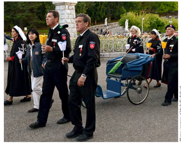
(continued from cover)