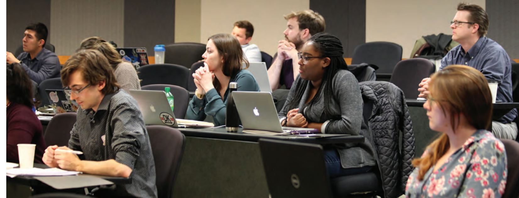
Law students from around the U.S. learned about space law and international research at the NASA Weekend Workshop hosted at Nebraska Law