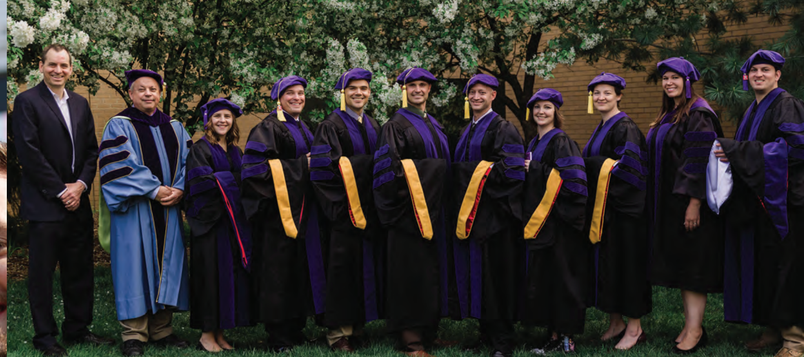
The 2018-2019 Space, Cyber, and Telecommunications students with faculty and leadership