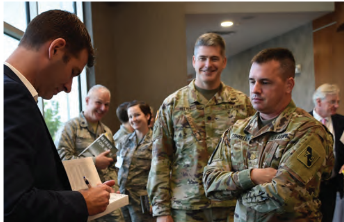
Author and keynote speaker Peter Singer signs a copy of his book Ghost Fleet for a conference attendee