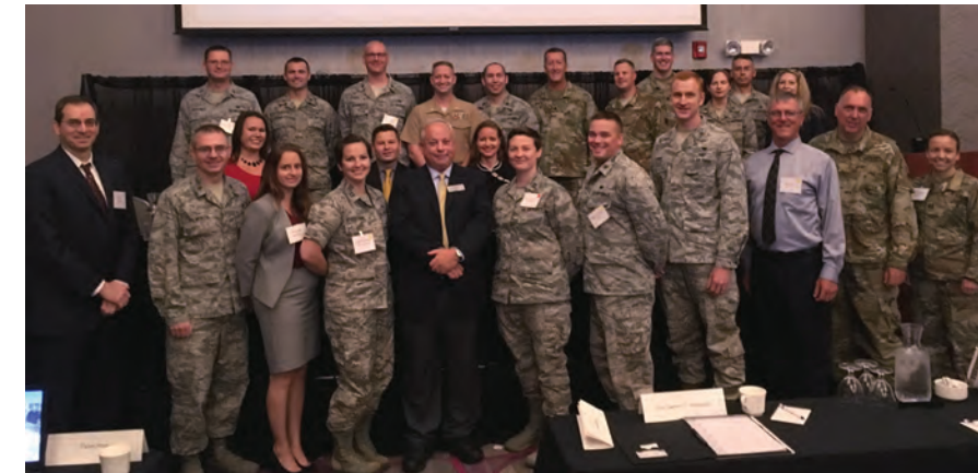
Current students and alumni of the University of Nebraska gathered during a break for a group photo

Author and scholar P.W. Singer keynoted the conference. Mr. Singer is a strategist at New America and an editor at Popular Science magazine. Mr. Singer’s novel, Ghost Fleet: A Novel of the Next World War , is a technothriller crossed with nonfiction research and has been endorsed by people who range from the Chairman of the Joint Chiefs to the co-inventor of the Internet to the writer of HBO Game of Thrones. His past work includes serving at the Office of the Secretary of Defense, Harvard University, and as the founding director of the Center for 21st Century Security and Intelligence at Brookings, where he was the youngest person named senior fellow in its 100-year history.