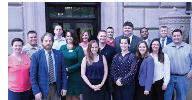
Faculty and students gathered for a group photo after the visit