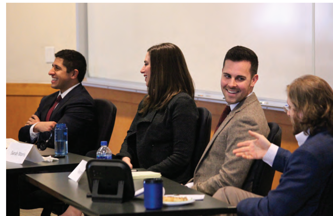
Alumni participate on a Government and Policy Speaker Series spring panel