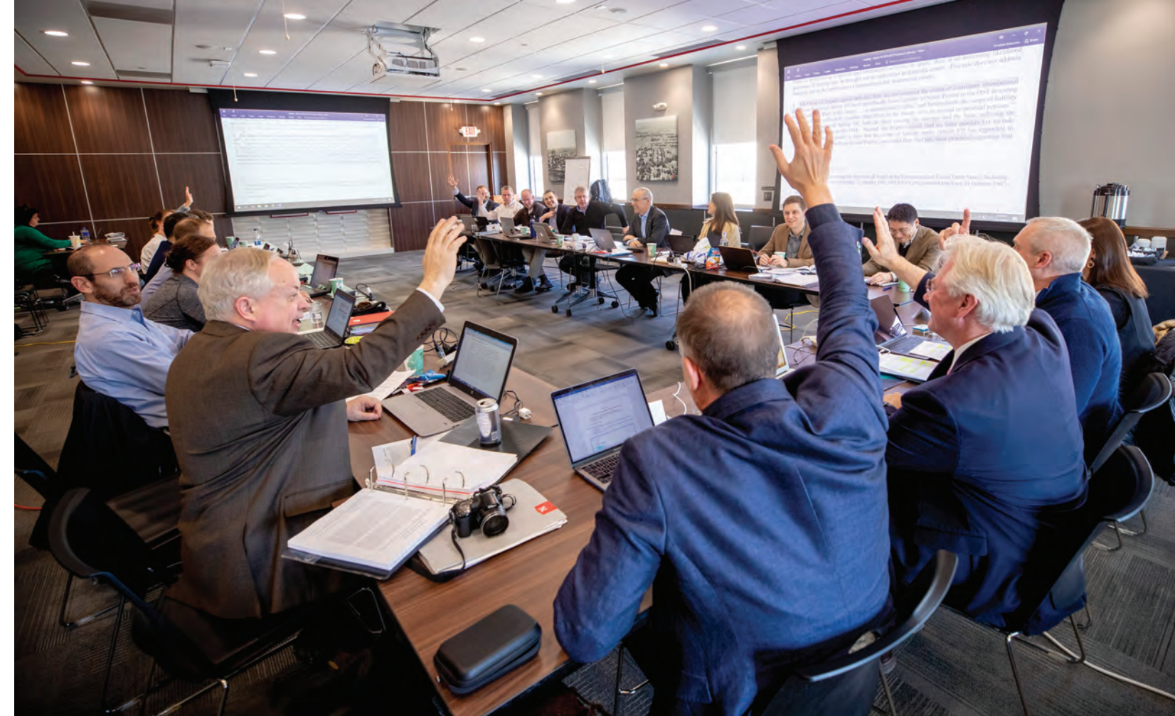
Woomera Manual participants taking a vote on manual provisions as part of the drafting process

Nebraska Law hosted one of these workshops in February 2019. Despite one of the state’s largest and most intense blizzards, the Woomera Manual experts gathered at the University of Nebraska Student Union for four days of drafting and meeting, pushing the Manual forward. While in Lincoln, the group also enjoyed the best food and shops the Railyard and Haymarket District has to offer.