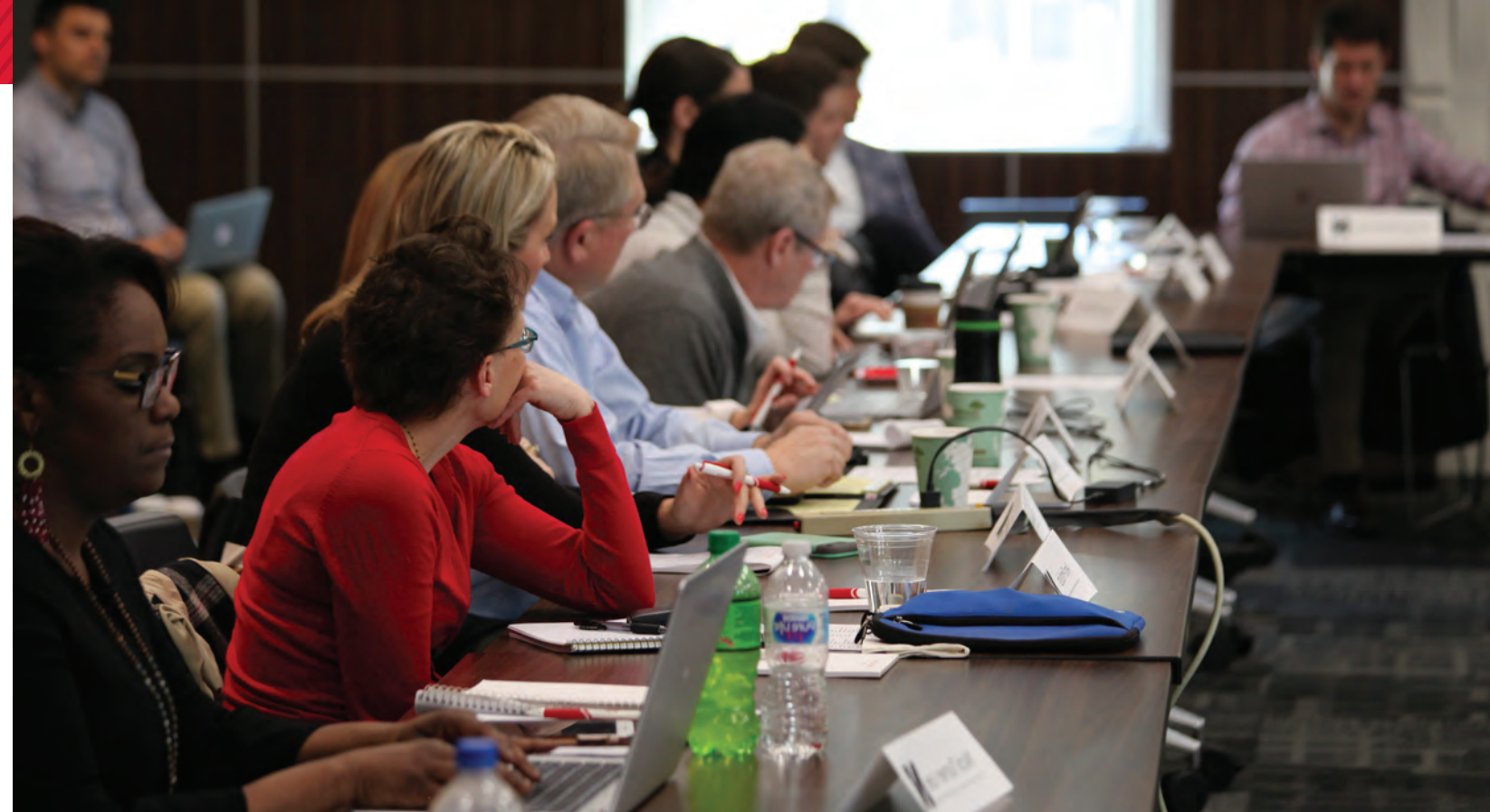
Stakeholders participate in the Second Annual Roundtable