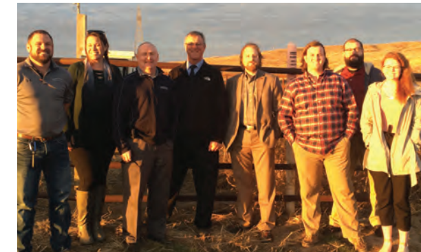
The group gathered in front of a cellular tower, directly next to a major feedlot for cattle production