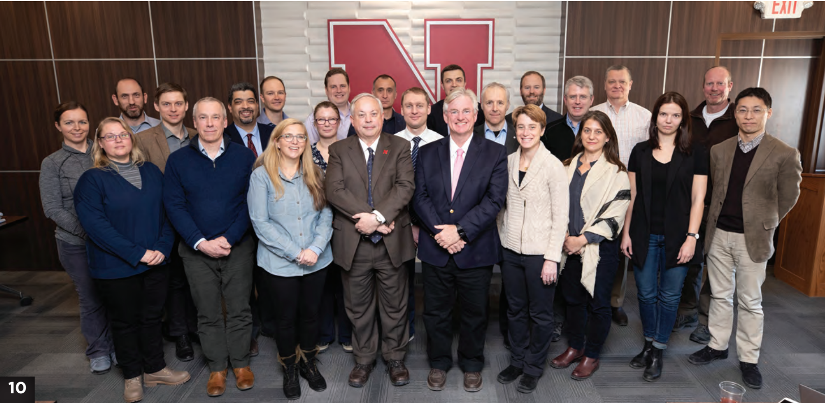
Woomera Manual project participants pose for a group photo this February at the Nebraska Union