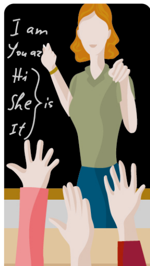
Older students often receive less oral language instruction because the emphasis is on reading, writing, and content.

Other factors that influence the instructional time dedicated to oral language instruction include the teacher’s expertise in second language teaching and confidence with oral language activities; class size; and the district’s and/or state’s English language proficiency (ELP) standards.