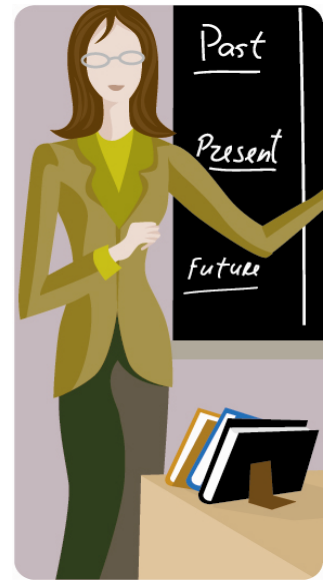
Some approaches to ELD instruction have overlooked oral language development as the foundation of written language.