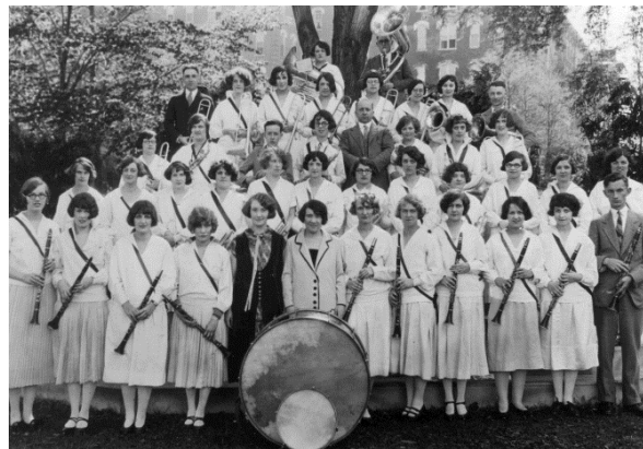
1907 Postcard of Thomas Sutton Hall and the newly built Conservatory of Music at Indiana State Normal School (ISNS); and the 1925 ISNS Band in front of John Sutton Hall.