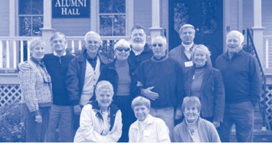
Keystone graduates gather in front of Alumni Hall during Homecoming.