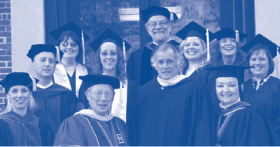
Members of the stage party gather prior to Commencement Exercises.