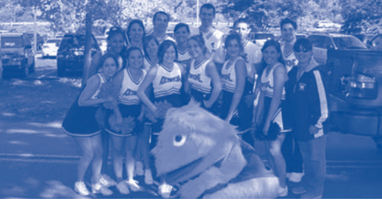
The Keystone College cheerleaders and mascot "KC" pose for a picture during the annual Homecoming Parade.