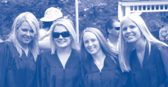
Proud Keystone graduates gather on the College Green following Commencement.