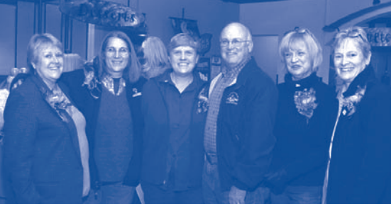
Friends of Keystone gather during Homecoming Weekend.