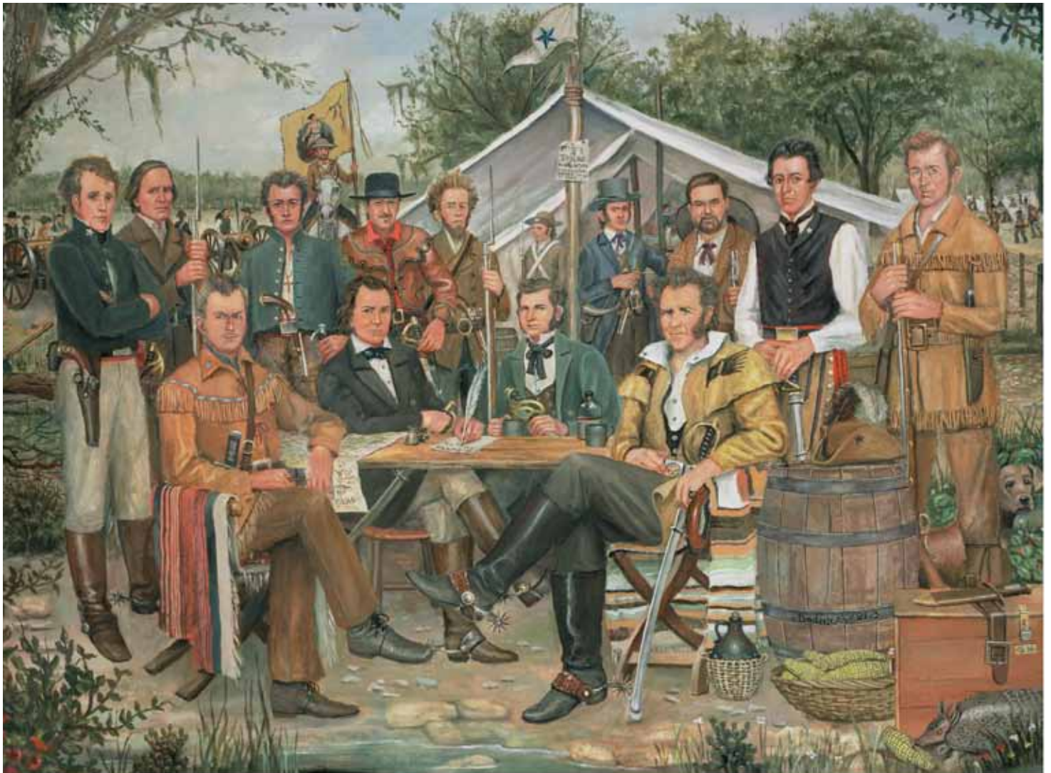
Standing L to R: Sidney Sherman, Ben McCulloch, Antonio Menchaca, Nepomuceno Flores, Jesse Billingsley, Manuel Flores, Juan Seguin, Erastus (Deaf) Smith Sitting L to R: Edward Burleson, Mirabeau B. Lamar, Thomas Rusk, Sam Houston "War Council at San Jacinto"