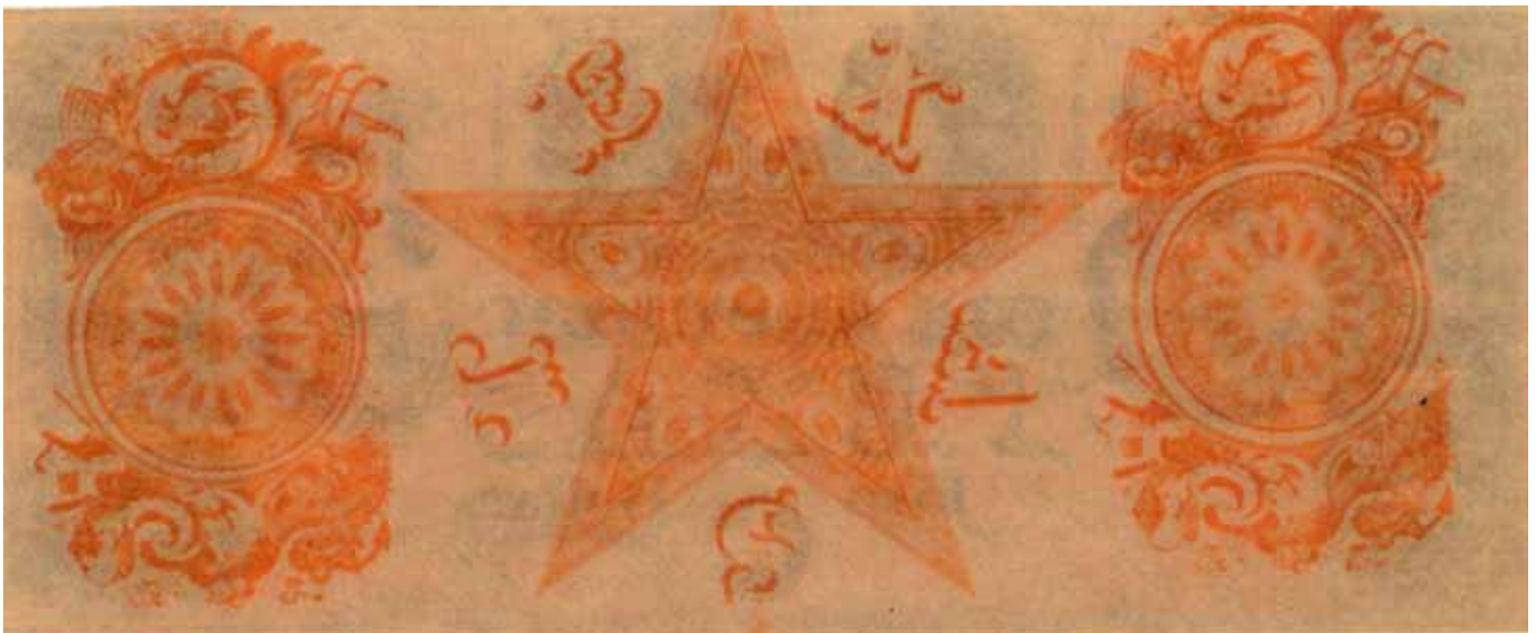
Below: Reverse side of Republic of Texas five-dollar bill