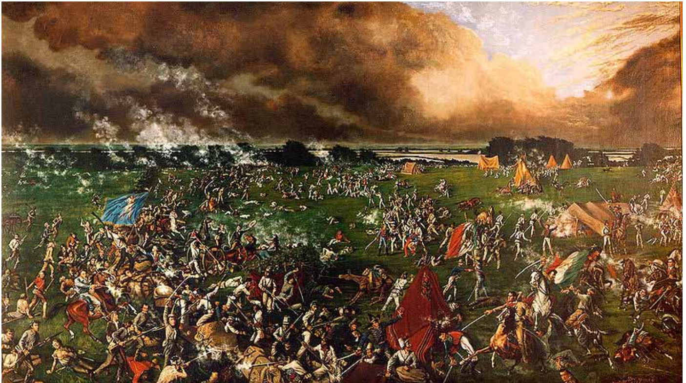
This 1895 large scale oil painting "The Battle of San Jacinto" by McArdle can be seen in the Texas Senate chamber. Smith can be seen at bottom right, with a red scarf, plunging a sword into an enemy combatant while riding a stolen Chestnut horse.

Before General Sam Houston personally chose Deaf Smith as a private to head the scout and spy unit of the Texian army, the progressively deafened soldier engaged in the first battles of the Texas Revolution against the Mexican army until the victorious Battle of San Jacinto. His involvement in the war can be broken into four parts, which dates from October 27, 1835 to April 23, 1836 and beyond. With the exception of a three-month recuperation period from a bullet wound, Smith took part in four full-fledged battles. However, most of his important military achievements were non-combat in nature and probably contributed more significantly than his role as a soldier in the four battles.