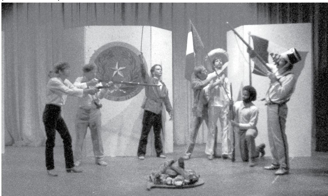
Scene from two-act play, "Deaf Smith: The Great Texian Scout" at the Texas School for the Deaf on May 25, 1985