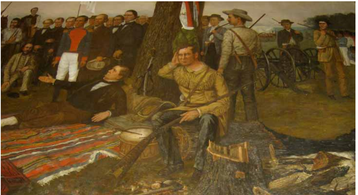
"The Surrender of Santa Anna" by William H. Huddle, located in the south entrance of the Texas Capitol. Injured General Sam Houston laying near Deaf Smith