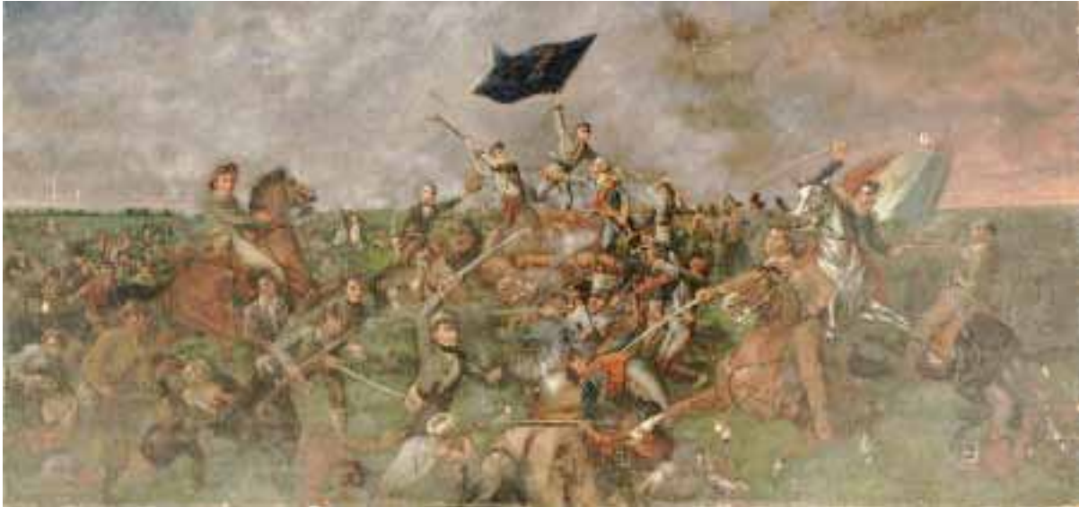
Deaf Smith, wearing a red scarf, is portrayed prominently riding a Mexican officer's horse that he captured using a Mexican saber. Smith is shown with reckless abandon.

When Heritage Auctions of Dallas announced the discovery of a lost oil painting by Henry A. McArdle (1836-1908) in October 2010, it turned out to be a scaled-down rendering of "The Battle of San Jacinto" that has been displayed in the Senate chamber of the Texas Capitol since 1898. The larger version is measured at the length of 14 feet (95 X 168 inches) while the smaller one, which was finished in 1901, is 5 X 7 feet (60 X 84 inches).