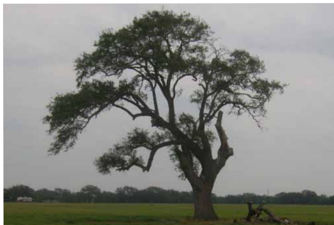
Photo of aging Deaf Smith Tree