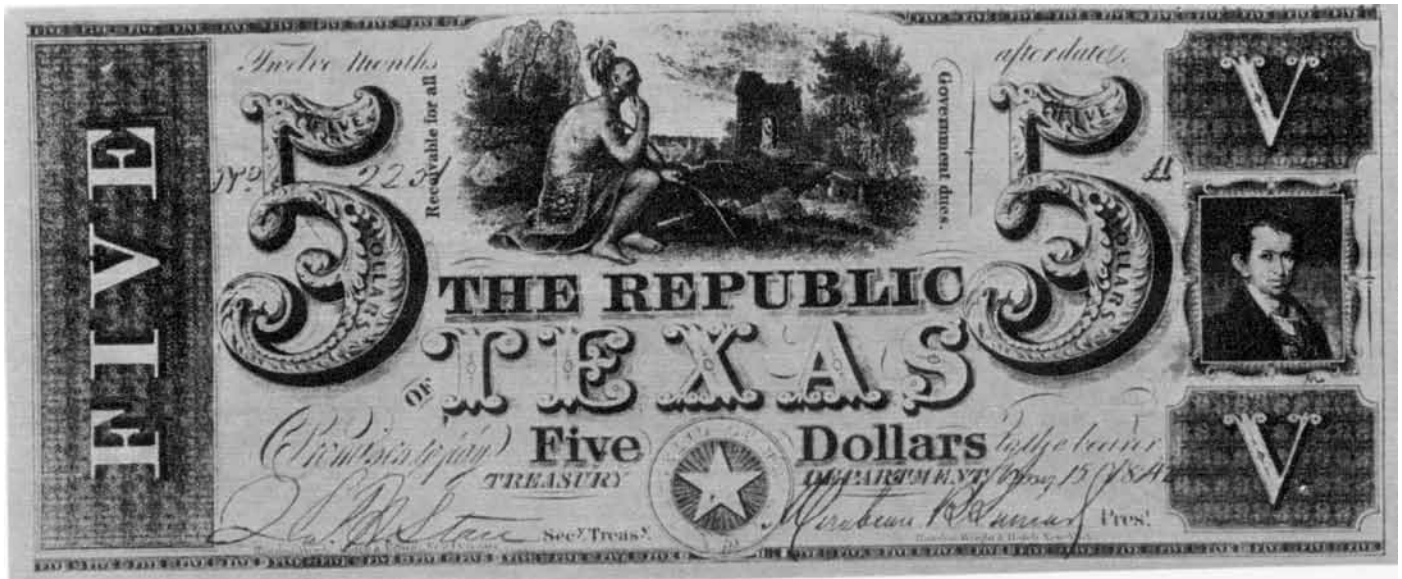
Above: Front of Republic of Texas five-dollar bill - Note Deaf Smith's photo on right.

Note: Bills were printed in Austin and New Orleans from 1837 to 1845. The value declined to a mere 6 cents before Texas joined the Union in 1845.