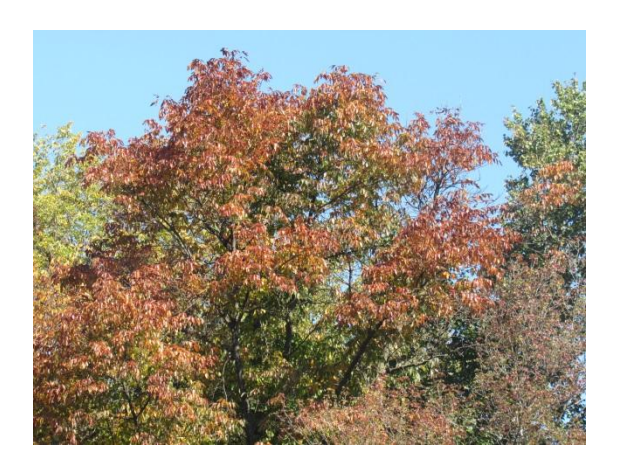
(Trees at Carver Park, Hackensack NJ)

JOIN US ON FACE BOOK-: www.facebook.com/hrg.homeless.nj