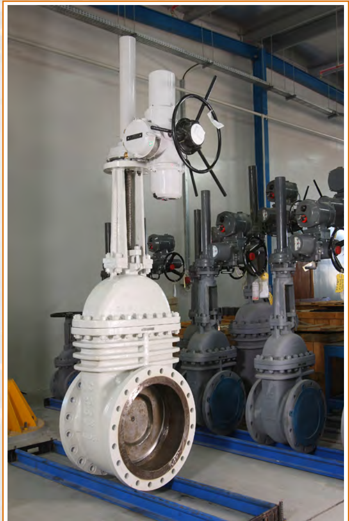
Supplied by JC Valves