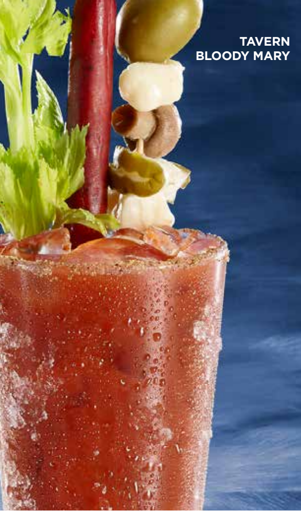
TAVERN BLOODY MARY