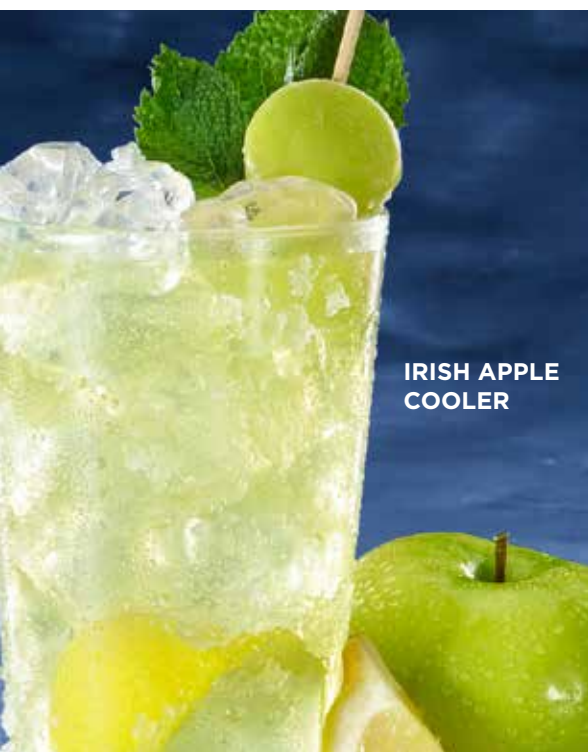
IRISH APPLE COOLER