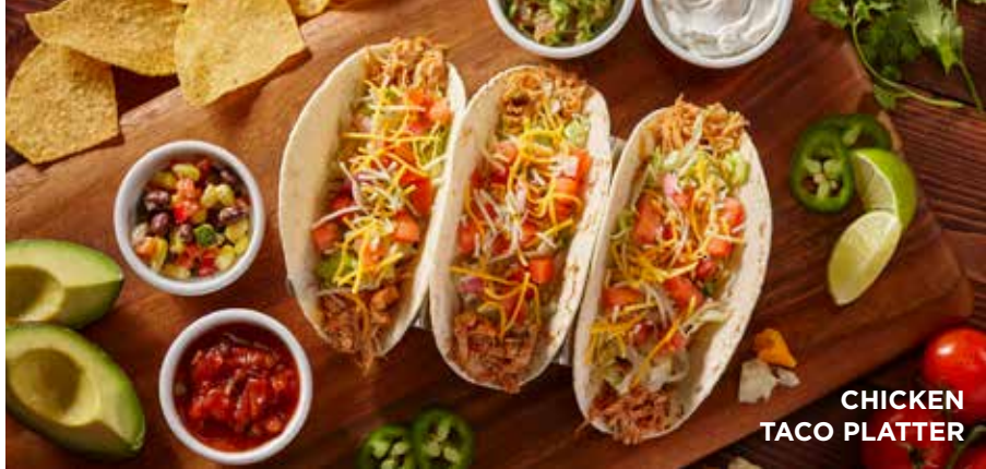
CHICKEN TACO PLATTER