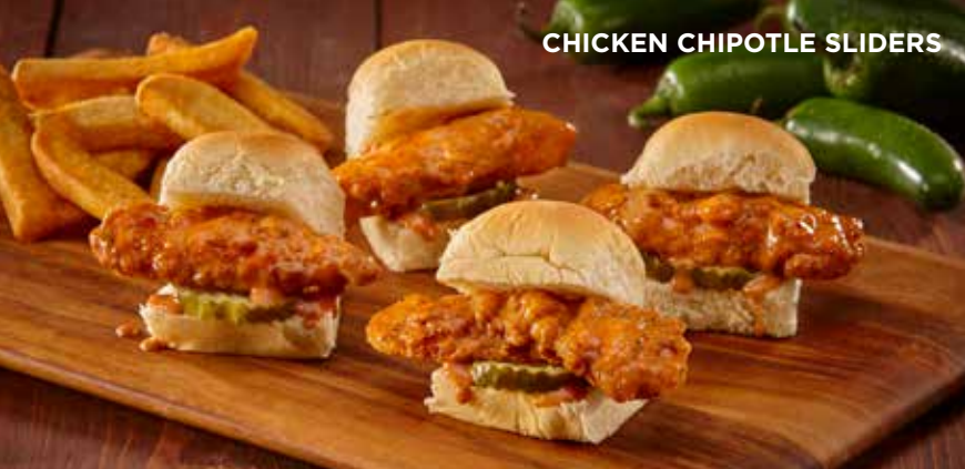
CHICKEN CHIPOTLE SLIDERS