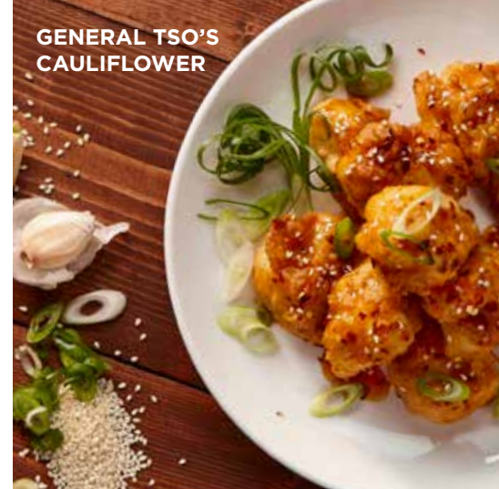
GENERAL TSO'S CAULIFLOWER