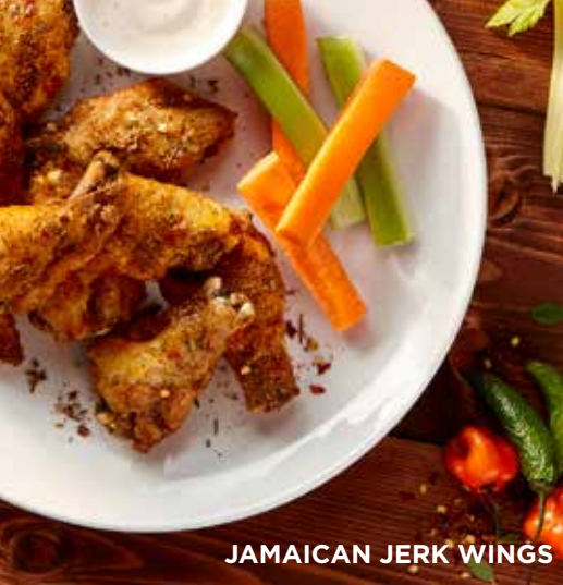
JAMAICAN JERK WINGS