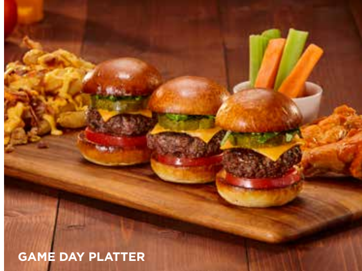
GAME DAY PLATTER