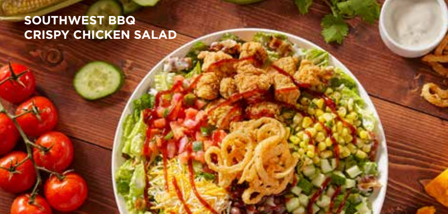
SOUTHWEST BBQ CRISPY CHICKEN SALAD