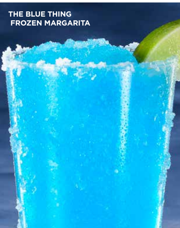
THE BLUE THING FROZEN MARGARITA