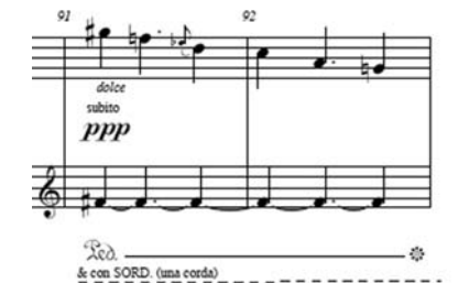
Figure 6: Radulescu, Second Piano Sonata, movt. 1, mm. 91-92.

This idea subsequently recurs in a canon at the major third below, and later in a three-voice transposition canon at m. 101. The fanfareidea also returns, with greater elaboration of its material. A second part of the development section begins at m. 127. Among its main features are re-explorations of material from the exposition with further spectral enrichment (added pitches, or 'functions', in various registers); and the increasing use of canonic textures, as for example when the Lydianmode second subject returns in a unison canon at m. 154 and, even more elaborately, both forwards and in retrograde, at m. 177.