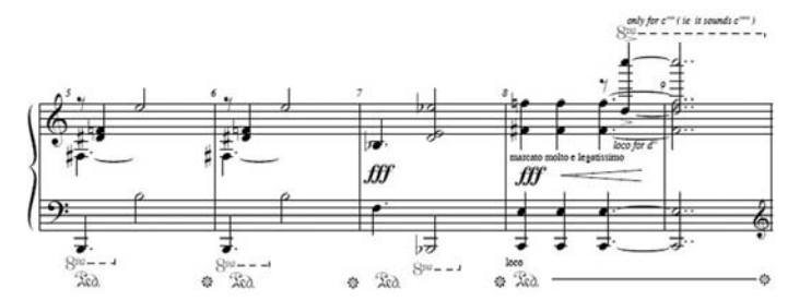
Figure 2: Radulescu, Second Piano Sonata, movement 1, mm, 1-9.

A sub-principle adheres within this practice. Radulescu believed that in these 'ring-modulated' sonorities the component partials should stay in the correct octave placement and should not be freely transposed by octave (i.e. not transposed downward; transposition up by an octave was permissible, as the transposed pitches would then simply correspond to a partial from a higher octave). In other words, to transpose the Eb in m.1 down by an octave to make the semitone cluster D-E<sub>b</sub>-E would, in his terms, make no sense: there is no partial in the harmonic series between the 10th and the 11th, so such a transposition would violate the spectral logic he was trying to establish. (The only way this might be justifiable is if one then considered the fundamental to be an octave lower still, so that the three notes of the cluster would be analogous to partials 20, 21 and 22. In this particular context that would imply an extremely low fundamental, 14.6 Hz, which is below the normal threshold of pitch perception and even below the 'black octave' of the Imperial Bösendorfer piano which Radulescu so adored. 13)