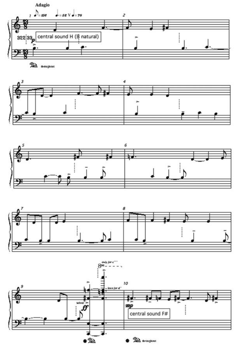
Figure 7: Radulescu, Second Piano Sonata, movt. 2, mm. 1–10.

Radulescu's own conception of the melodic nature of this second movement was, however, somewhat different to the one just given. He regarded the melody not as the mixing of modes but as the 'introspection' of the 'Origin-chord':