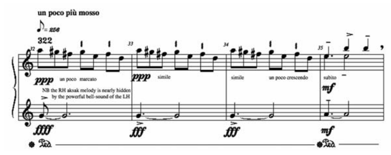
Figure 4: Radulescu, Second Piano Sonata, movt. 1, mm. 32–35.

The second theme, occurring first at m.32, is an invented folk-like melody played quietly in the right hand as though a spectral emanation from the pedal notes played very strongly by the left (Figure 4). The tune itself, in its extreme simplicity, suggests a Lydian mode on D, but the bell-like pedal note from which it emerges is an 'alien' G natural, not part of the mode. Radulescu explained this bimodality in spectral terms: G is the actual fundamental here, and the Lydian mode is actually partials 8, 9, 10, 11 and 12 of D, itself the third partial of G. This is an example of the 'emanation of the immanence' idea (discussed in footnote 15): just as the G contains a whole harmonic series, so too does each of its partials contain its own potential (if hidden) series, one of which is here allowed to sound. Bar 35 may be considered a transposition upwards, by a tone, of this relationship.