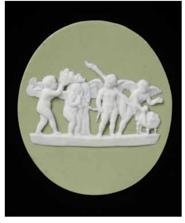
Josiah Wedgwood, Marriage of Cupid and Psyche, white jasperware with green dip with applied basrelief in white, Staffordshire, c. 1790–1800