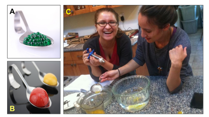
Modern Chemistry in the Kitchen. A. Mint direct spherification. B. Reverse or indirect spherification of liquid flavors. C. Students preparing their own creation of a direct spherification

This laboratory describes three types of molecular gastronomy style (aka modernist cuisine) food experiments. Gels and hydrocolloids are examples of food polymers. Many food polymers including complex polysaccharides, can bind a significant number of water molecules due to many polar bonds found their carboxyl and alcohol functional groups. Because these long polymers bind to shells of water and interact with each other (sometimes binding directly to each other called cross-linking), gels and hydrocolloids add a viscosity to a solution. At higher concentrations they form a semi-solid "gel" as the polymers will interact with each other. These long strands of polymers will tangle, can cross-link and have a tremendous water holding ability. This means the water is "held in place" by the intertwined gels and hydrocolloids. Altogether, this physical interaction creates a coherent liquid mass that is used for many purposes. A simple examination of food in the freezer section (frozen prepared