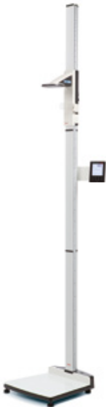
Wireless measuring station seca 285

The new approach for weight related patient education.