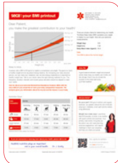
Example for a seca directprint for an Obese I Patient