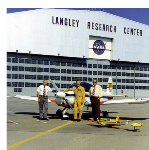
Above: James Patton Jr. (center) stands with James Bowman Jr. (left) and Sanger Burk (right) in front of a low-wing spin-research aircraft. A radio-controlled model and a spin-tunnel model of the same configuration are in the foreground.

Bottom Left: The ERCO Ercoupe is one of the earliest aircraft with spin-resistant characteristics, which were achieved by limiting the deflection of control surfaces (including the elimination of rudder pedals from the cockpit), as well as the location of its center of gravity.