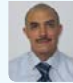
Walid Attia National Neuroscience Institute