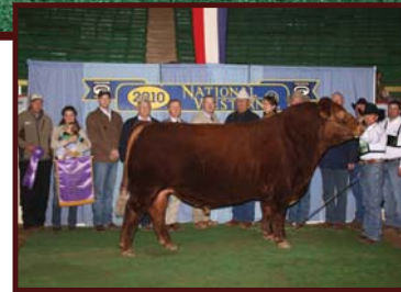
Lot 4 STF Dominance 2010 National Western Grand Champion Bull. Sire of Embryos.