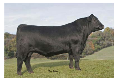
SAV Mandan Sire of Lot 28