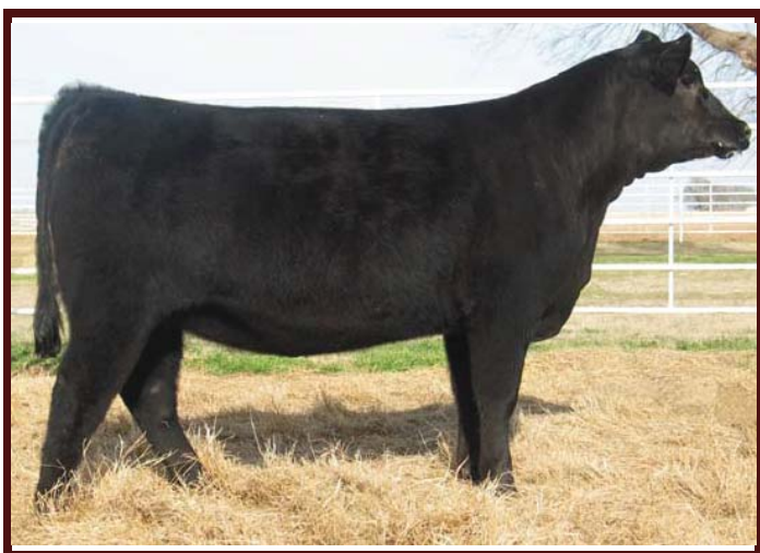
High Selling Sundance daughter in last years sale going to FlyCatcher Farms.

Jodie 0229 is an outstanding BC Look out daughter that can be best described as cow power with her added body depth and ease of fleshing look. The dam of Jodie 0229 was Reserve Grand Champion Angus Female at San Antonio and Star of Texas in 2004.