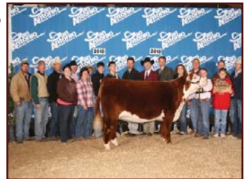
KLD BR CAROL NEON Supreme Champion 2010 San Antonio Junior heifer show.