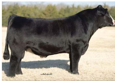
Steel Force Sire of Lot 32