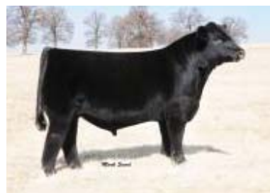
Limestone Darkhorse Sire of Lot 25