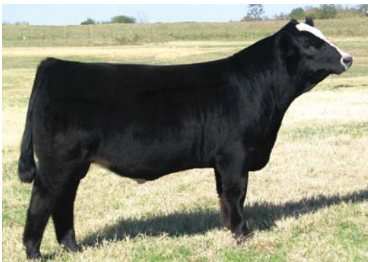
TAMU FREEDOM Sire of many of the lots in the sale.

I can't say enough of the consistency of the TAMU Freedom daughters they could be picked out of a herd of hundreds and they all have the look of productive cattle with a high degree of rib and depth as well as having that low input look that we associate with efficiency. Raven has a nice look and will always be a productive and effective brood cow and to top it off she will be competitive in the ring for a junior project.