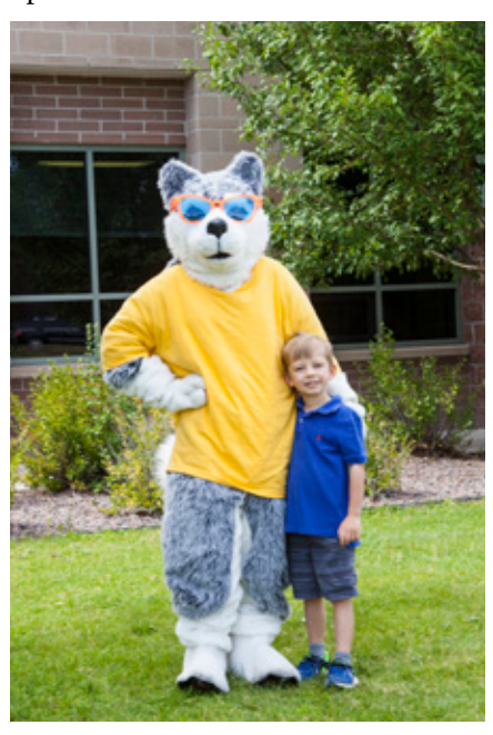
∧ Blizzard and Shaw's Sun Safety team teach grade-schoolers the importance of sun protection.

Protect against the sun You can't teach kids sun safety too soon, says Shaw's team. They talked with nearly 1,200 students at local grade schools this spring. Each child received a bag filled with sunscreen, lip balm, snacks and information.