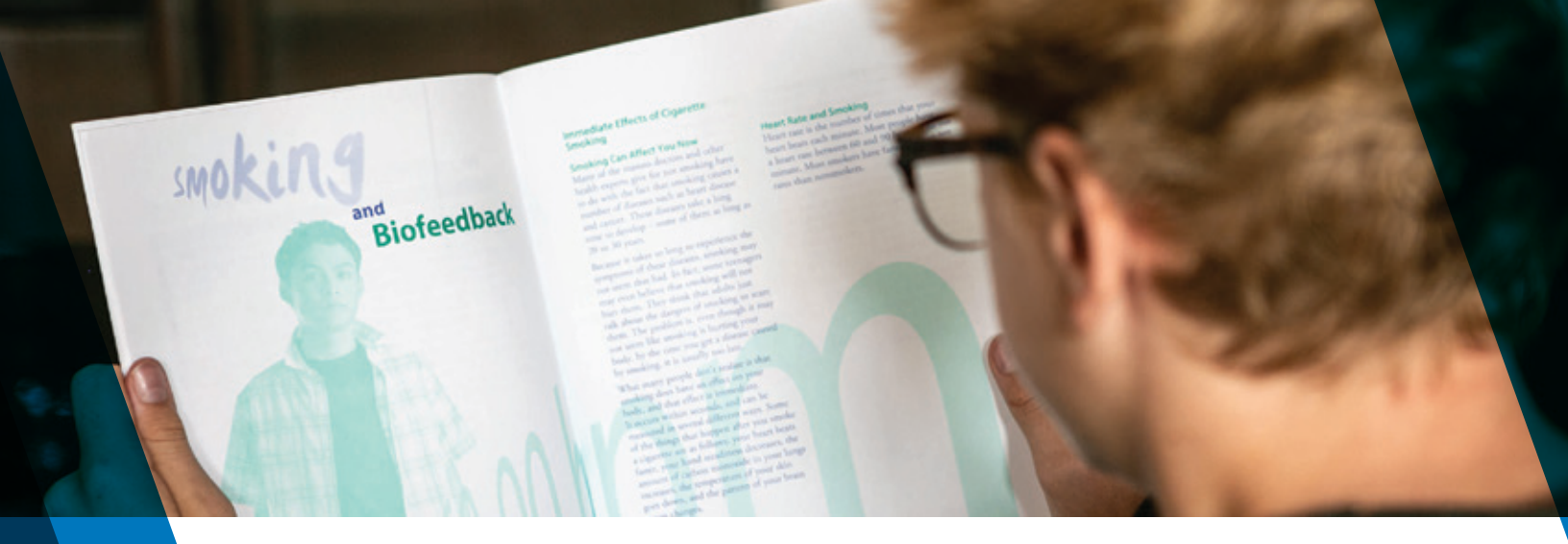
∧ Your gifts helped Eagle County kids quit smoking.