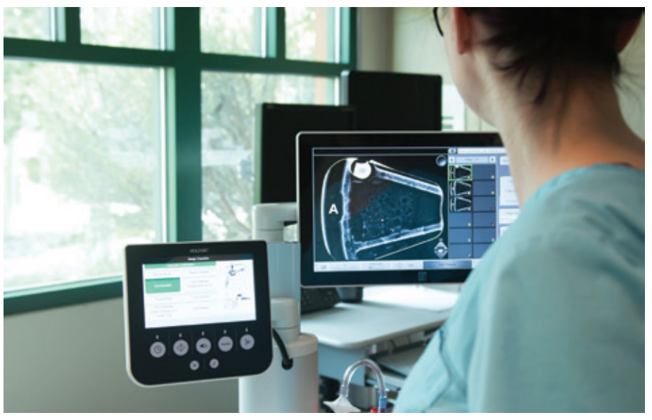
∧ Thanks to you, Sonnenalp Breast Center is the first in Colorado to have the Brevera® Breast Biopsy system.

locate the tumor during surgery. The doctor uses a probe to pinpoint the seed, which marks the tissue needing to be removed.