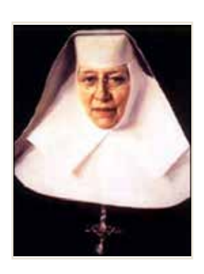
1858–1955 Feast Day: March 3

Katharine was the second child of a very wealthy family in Philadelphia. For years her family had used their money to found and support good causes, such as schools and hospitals.