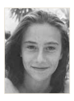
1971–1990 Feast Day: October 29