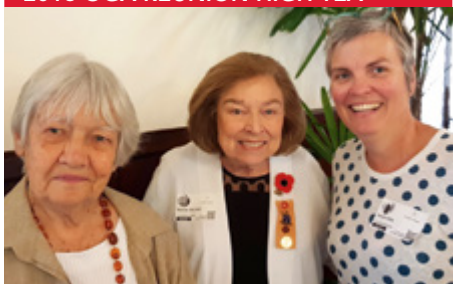
2018 OGA REUNION HIGH TEA