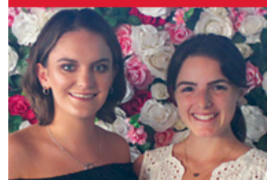
YOUNG OLD GIRLS EVENT @ MIAMI MARKETTA