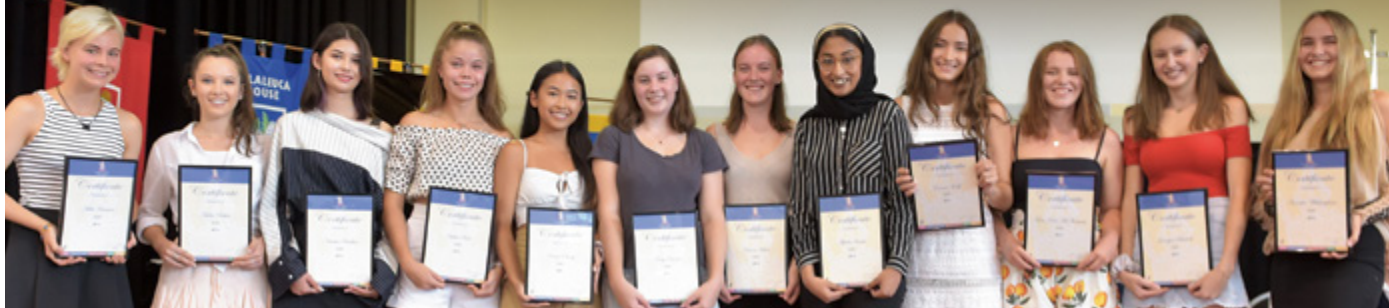
St Hilda's 2018 OP 1-3 recipients.

We extend special congratulations to the 12 students from our most recent alumni group, our 2018 graduates, who achieved an OP 1-3 and further congratulations to the two students among those who received the highest score possible in Queensland, an OP 1.