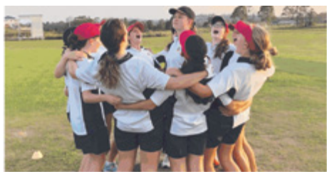
The St Hilda's school made its own history by winning a cricket team in the Queensland Girls Secondary Schools Association Sports for the first time.

Unfortunately, the ballgames competition was cancelled due to inclement weather, but it was wonderful to see our rich sporting history revisited (and to see the traditional babushka head scarves come back out in school colours!).