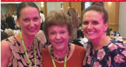
INTERNATIONAL WOMEN'S DAY BREAKFAST