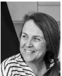
Naomi Shihab Nye , Poet