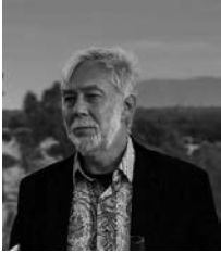
Roy Baumeister , Professor of Social Psychology at University of Queensland