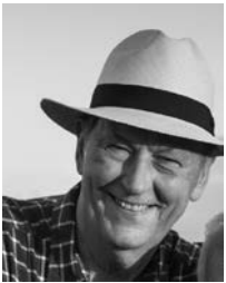
Bill Bradley , Former U.S. Senator & Former NBA Basketball Player