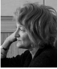
Krista Tippett , Radio Broadcaster, Journalist, Author & Entrepreneur