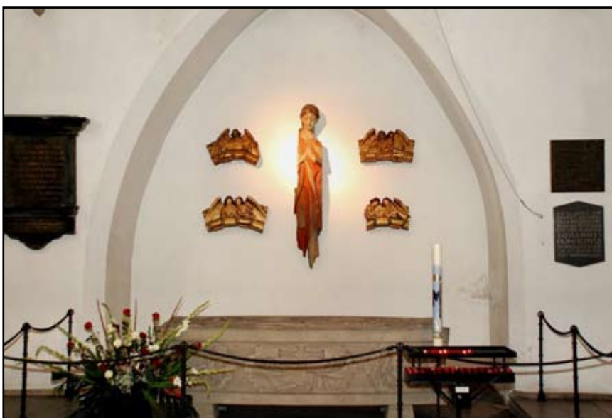
Sarcophagus of John Duns Scotus