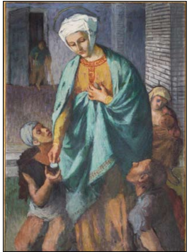
St Elizabeth of Hungary, Patron OFS

Del Pozo offered some challenges for the future. These include (1) the deepening of the formation process; (2) the intensification and revitalisation of the local Fraternity, where the life of the Order exists and vocations are developed; (3) the increase of the sense of mission in the world; (4) the consideration of different ways of living within the Secular Franciscan Order, such as family groups, young couples and groups arising from Franciscan Youth; (5) the fostering of the call to holiness, with fraternities becoming home to individuals who, taking their baptism seriously, want to become saints.