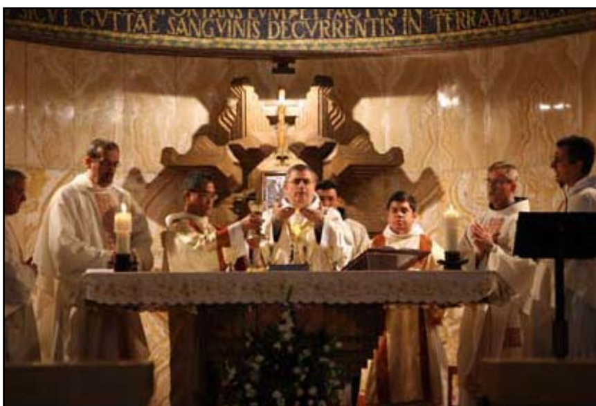
Minister General celebrates Mass in Jerusalem on Feastday of Scotus