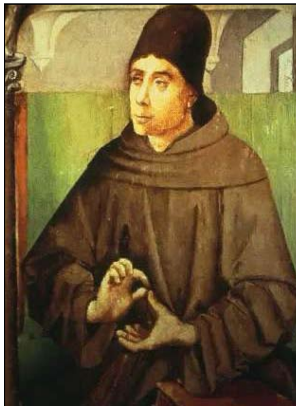
John Duns Scotus

The Minister General of the Friars Minor, Fr.