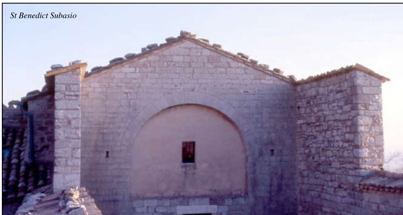
St Benedict Subasio

Afterwards, winter, with its interminable nights. The trees became bare. Snow fell and mantled the