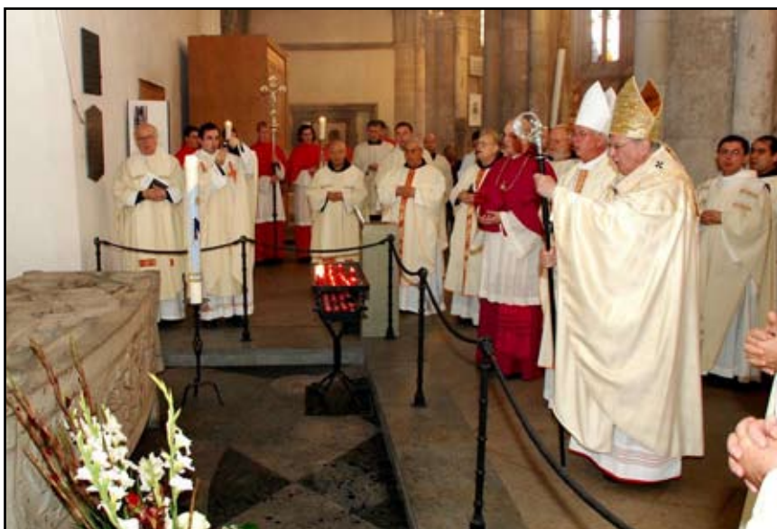
Celebration of Duns Scotus at Minoritenkirche

After his ordination John Duns Scotus continued to specialise in the Franciscan school of the University of Oxford, going