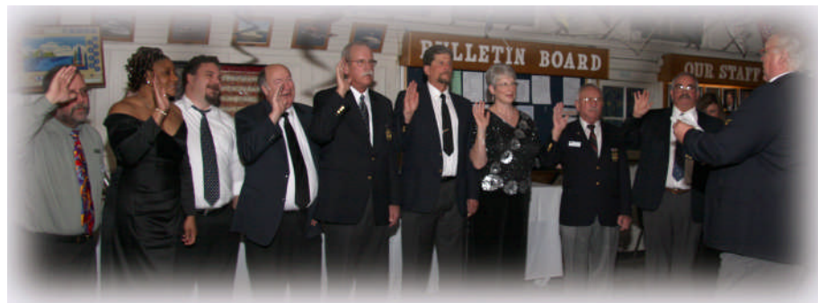
2008 Officers are sworn in at the Installation Dinner