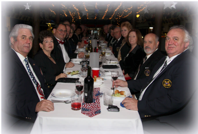
Past Commodores' Table at the Installation Dinner