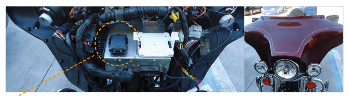
SPOT Trace mounted under the fiberglass fairing of a motorcycle using the included Velcro strip and mounting bracket.