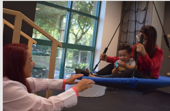
Platt College Anaheim's OTA instructor works in campus' Pediatric Lab