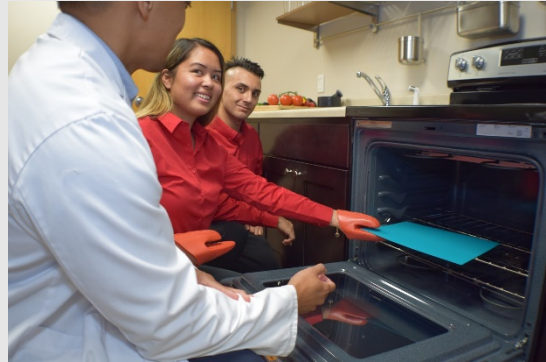
Platt College Anaheim's Home Health Lab