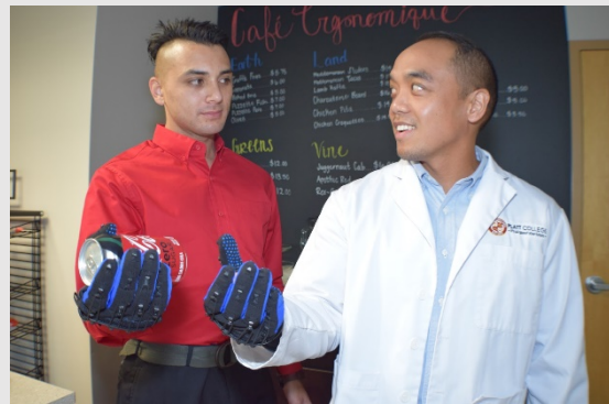
Platt College Anaheim OTA instructor demonstrates the lab's SaeboGlove

Overhead Balance Trainer — The Overhead Balance Trainer stabilizes a client who may have balance issues and enables students to safely work with clients on other specific activities.