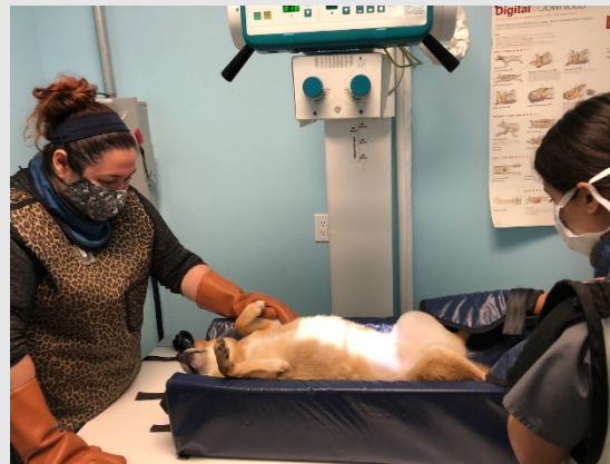
Two Platt College Alhambra students working with a patient at Banfield's radiographic lab.