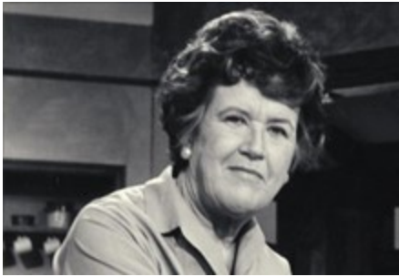
JULIA CHILD: BEST BITES 12 noon and 5 p.m.

Here are some of the special programs with related thank you gifts coming to you on Saturday, February 29.