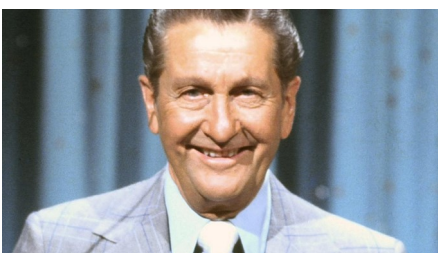
LAWRENCE WELK: GOD BLESS AMERICA 6:30 p.m.