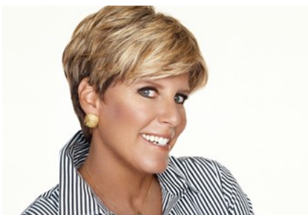
SUZE ORMAN'S ULTIMATE RETIREMENT GUIDE 3 p.m.