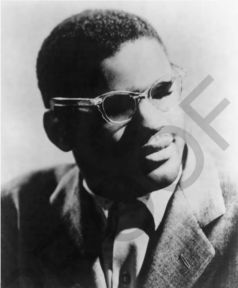
Ray Charles circa 1949, just after he left his home state of Florida.

In the years immediately following World War II, the talent level was so high and the pool around him so deep that, talented as he was, “RC” struggled to make it as a working professional—and at times, to eat. Later in his career he attributed his success in part to this cutthroat environment, saying, “Florida toughened me up.”