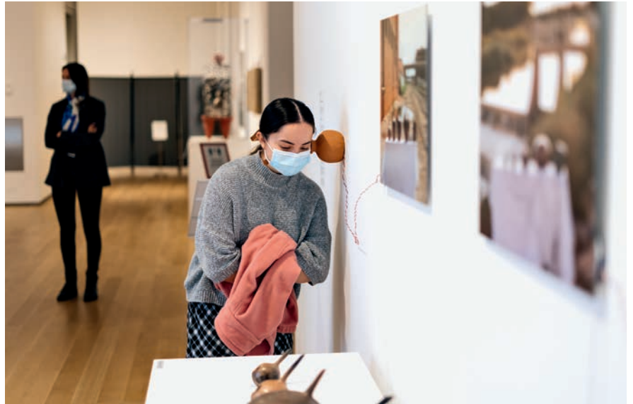
(top) Dartmouth students on a Tiny Tour of the Hood Museum.

We recently launched Escape to the Outdoors , a fully digital escape room-style game featuring public art on Dartmouth's campus. Players will work through a series of challenges featuring puzzles, riddles, and hidden codes related to six outdoor sculptures. Along the way, they will learn about these extraordinary works of art and their relationships to campus and community.