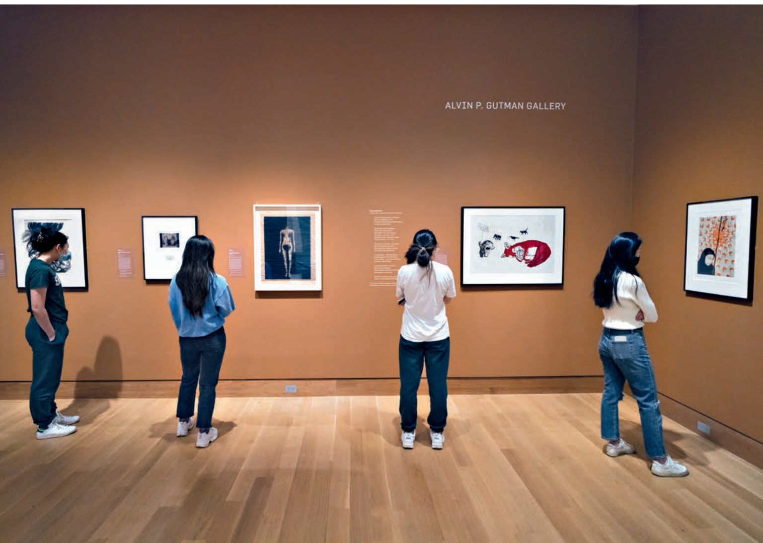
ALVIN P. GUTMAN GALLERY