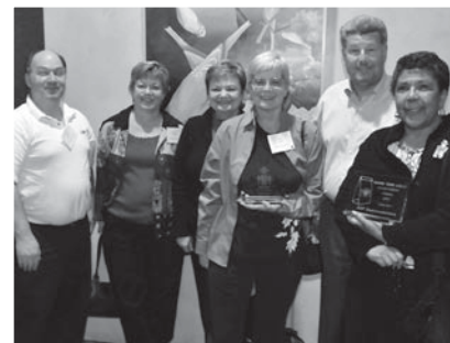
NXP employees gather for a photo with their awards.

The company or organization with the highest per capita donations during the 2007 Share Your Lunch Campaign