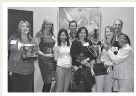
Cypress Employees pose with their awards.

Company with the highest per capita donation and more than 50,000 points total in a single year