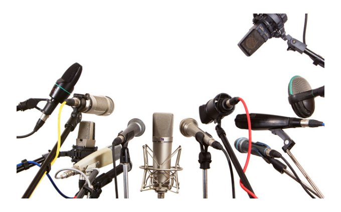
RVCO - Good News

The RVCO Annual Appeal is now going on. We certainly can use YOUR help as we try to finance some much needed equipment and technology. Thank you to all for your generous donations. It is greatly appreciated.