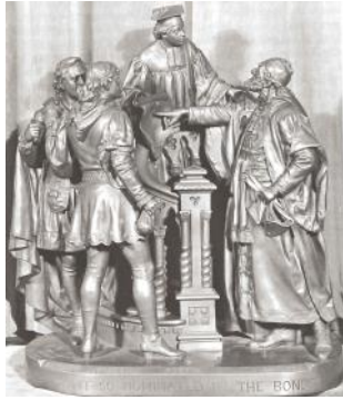
Two examples of Rogers Groups that will be highlighted in the new exhibit opening in May, 2019. (Left) "Checkers at the Farm," 1875, Plaster. (Right) "Is It So Nominated in the Bond," 1880, depicts a scene from Shakespeare's "Merchant of Venice."