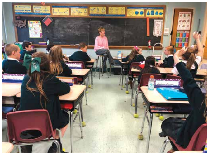
Moving up to the next grade to get a sneak peak of next year...