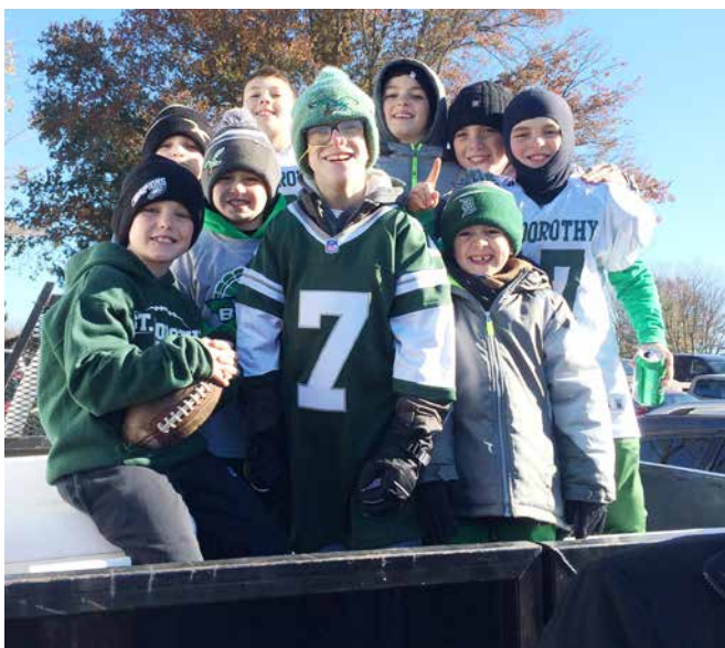
These students are enjoying the Turkey Bowl atmosphere... as well as the view of the games from the back of this pickup truck.