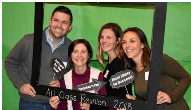
The Flick kids all grown up