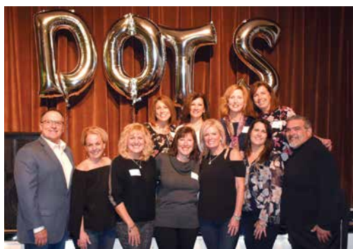
Members of the Class of 1981