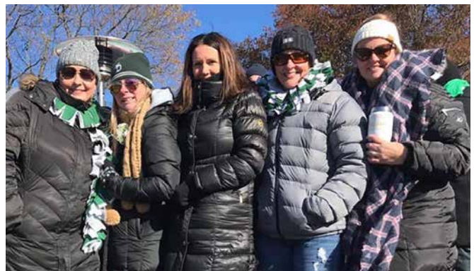
It was a VERY cold day but that didn't stop our supporters, including these bundled-up Dot's moms.