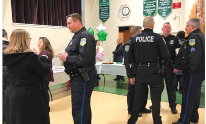
Just a small thanks from St. Dots to those who protect us.

Our week ended with the annual Variety Show and then a night of bowling. The week was a wonderful celebration of all those who make our school an special.