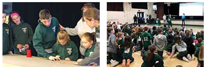
Some of our students having fun playing Minute to Win it...while others had a spirited lip synch contest.