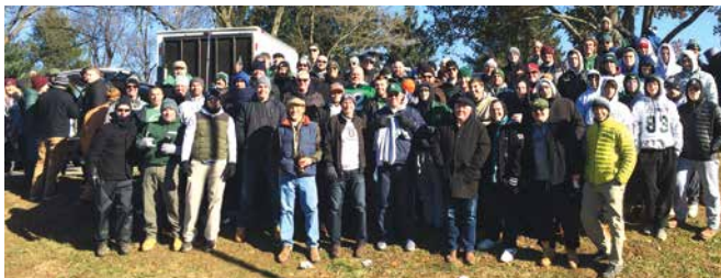
It's like this every year... and this is only a fraction of the attendees.