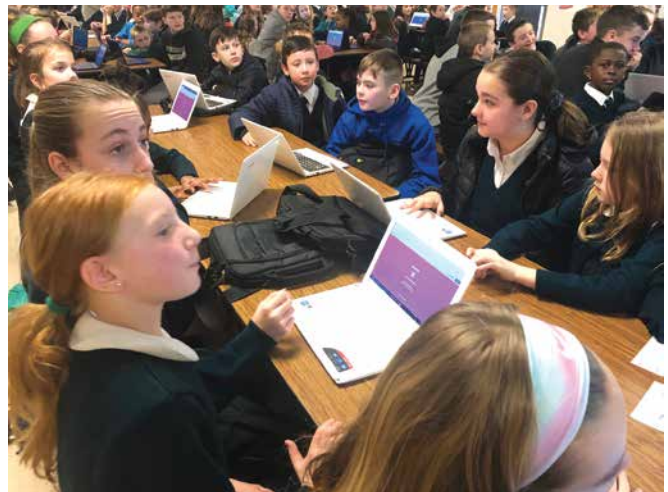
These kids are in "Kahoots" together!