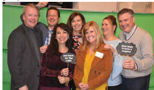
Former classmates having some fun with the photo props