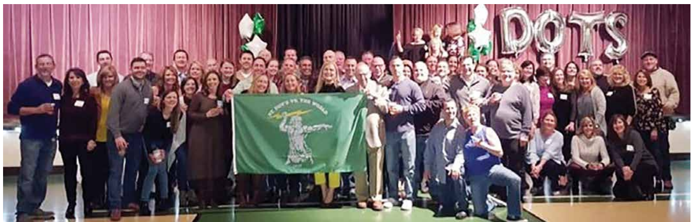
Group photo from the All-Class Reunion... a great time was had by all!!!

Knowing there are people we can count on year after year means so much. With a committed base of support , St. Dots is able to make plans for coming years and continue to enhance the learning environment for our students .