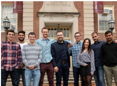
Above: Outside Marston Hall with grad students.

Gerasimidis has been active in the field of infrastructure resilience, structural response of critical infrastructure systems subjected to