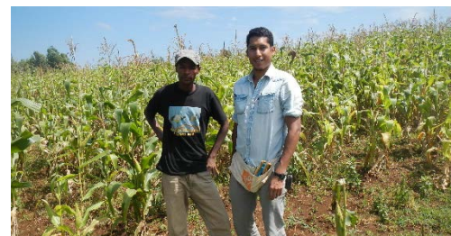
Soil sampling in a maize field at the Debre Mawi Watershed in Ethiopia with field research assistants.