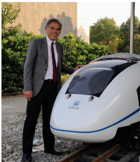
Above and above right: High speed train scale model at the Tongji University Rail Transit Outdoor Laboratory.