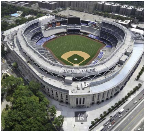
Above: The new Yankee Stadium.