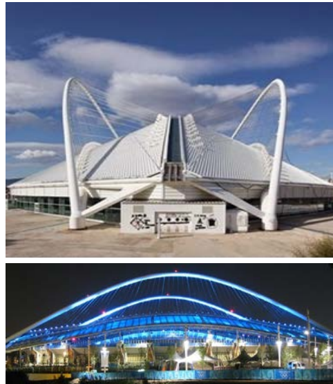
Above: Olympic Stadium, Athens, Greece.

structures for the coverage of the main Olympic Stadium and the Olympic Velodrome; the steel superstructure and foundation of the Agora; the steel Entrance Canopies; the frame-type steel structure for the Nations' Wall; the tubular-steel structure for the Monument; and the cable-stayed steel footbridge at the Katehaki metro station.