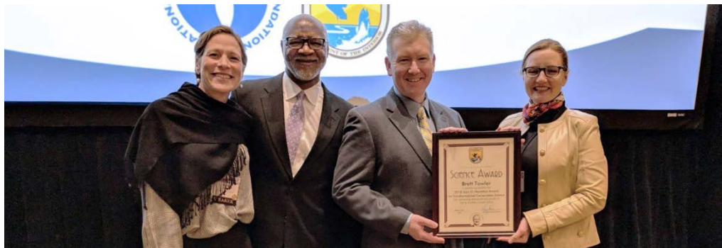
Above: US Fish and Wildlife Service photo of Region 5 staff celebrated for migratory fish work.