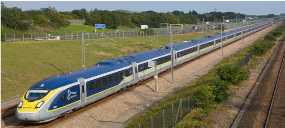
Above: Eurostar is the high-speed passenger train linking London with Paris, Lille & Brussels via the Channel Tunnel at up to 186 mph.