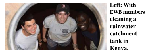
Left: With EWB members cleaning a rainwater catchment tank in Kenya.

Hometown: Quincy, Massachusetts Year: Senior, 2019 graduate Hobbies: Dancing, hiking, reading, watching sunsets