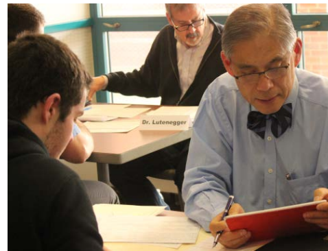
Above: An afternoon of student advising.

The CEE is fortunate, indeed, to have such an accomplished professional engineer, teacher, and researcher on its faculty.