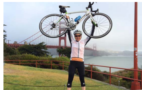
Above: Wood after biking with the Texas 4000 riders, on a mission to cultivate student leaders and engage communities in the fight against cancer.

Sharon's discussion reflected on how the first multi-story reinforced concrete buildings were constructed in Europe in the 1850s, and by the turn of the 20 th century, reinforced concrete was being used throughout the U.S. for building construction. The development of design and materials standards lagged behind the construction industry, and contractors used a wide variety of patented technologies, including types of reinforcement and design approaches, in their buildings. Load tests were frequently used to demonstrate the adequacy of an individual building, but many conflicting opinions regarding structural behavior existed. Only through structural testing of reinforced concrete members in the laboratory, did engineers begin to develop the theories that form the foundation of our current building codes. Fundamental observations from early tests were reviewed and the impact on modern construction discussed.