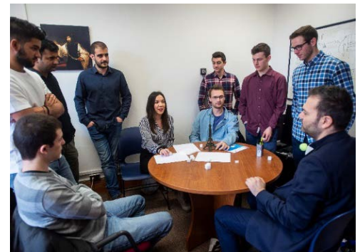
Above: Program meeting with grad students.

This impressive body of work is yet more indication of the high quality of the faculty members teaching and researching in the CEE department of UMass Amherst.