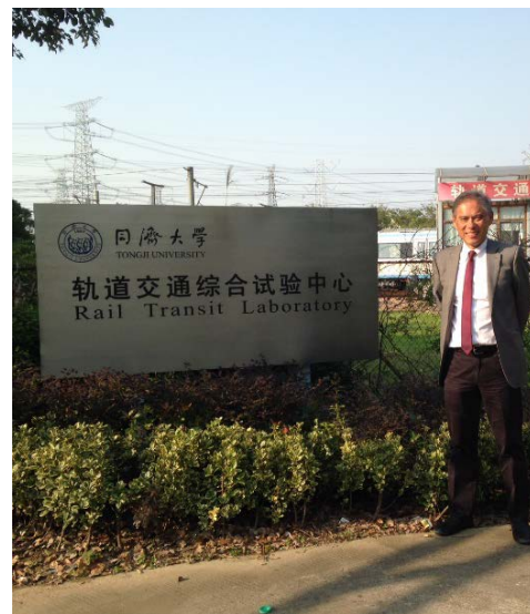
Above and above right: High speed train scale model at the Tongji University Rail Transit Outdoor Laboratory.