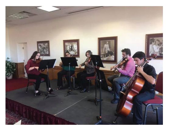
Members of the String Orchestra played several musical selections at the board of trustees dinner on April 15.

"We've established an active Facebook page and are now livestreaming most