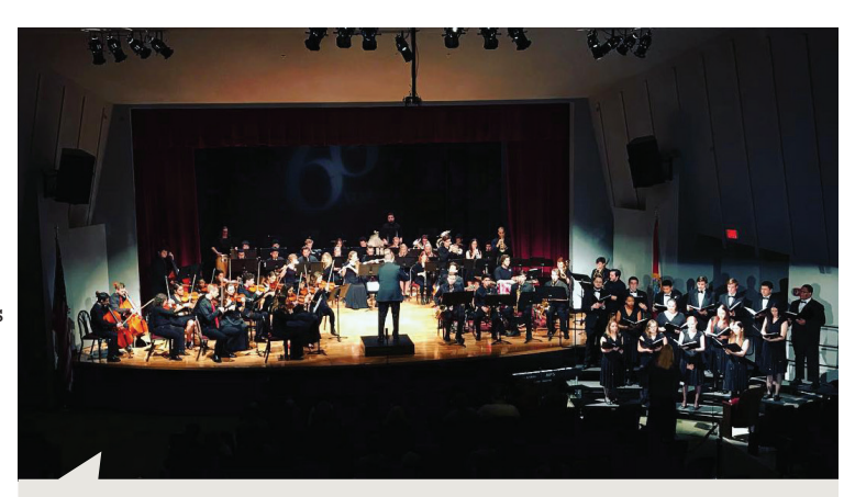
Group ensembles in the Florida Tech music program celebrated the university's 60th Anniversary with a special concert on Feb. 12 in the Gleason Performing Arts Center.

"We've also bolstered our infrastructure in terms of marketing, record keeping and equipment, so