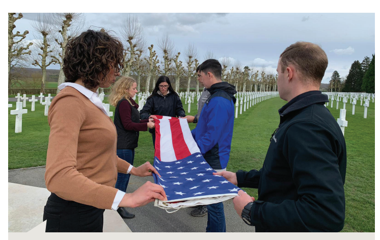
Florida Tech's senior ROTC cadets participated in a U.S. flaq-lowering ceremony at a cemetery in Normandy.

Over spring break in early March, Florida Tech's senior ROTC cadets completed their staff ride, a battle analysis trip with interspersed discussions and presentations.