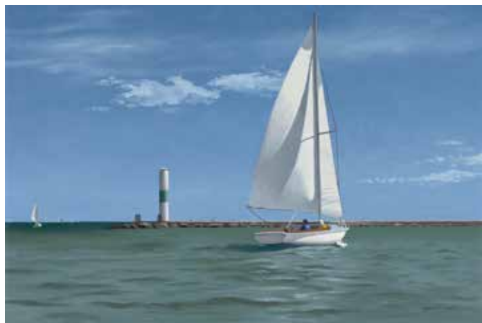
"Come Sail Away," Oil