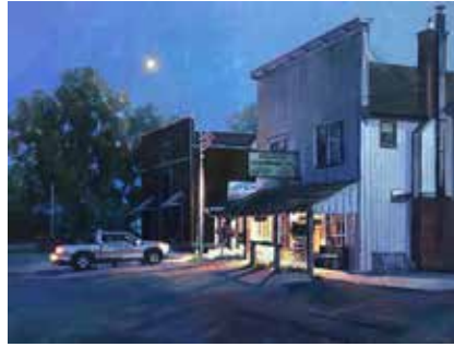
"Last Errand," Oil