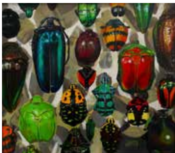
"Snug As a Bug," Oil