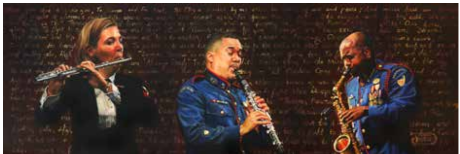
"Always Ready," Oil