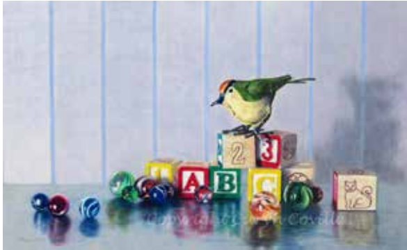
"Bird's Eye View," Colored Pencil

https://www.artroomgalleryonline.com/exhibitions/2020/november_2020.html