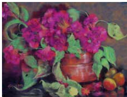
Coxcomb and Still Life," Oil