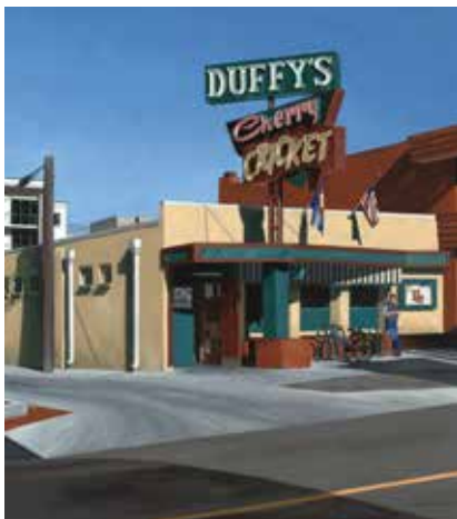
"Eat, Drink and Be Cherry," Oil