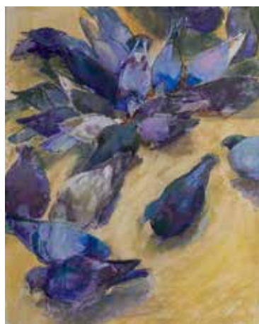
"Messenger Service," Pastel