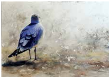
"Toes in the Sand," Watercolor