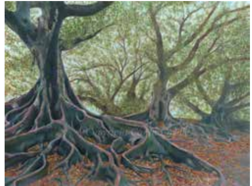
"Bird's Eye View," Colored Pencil