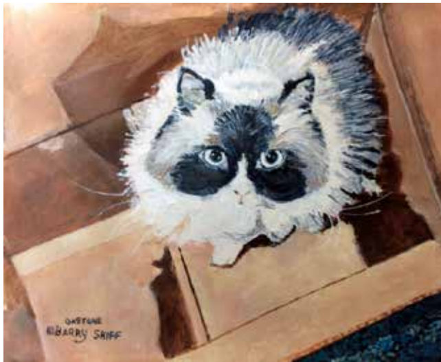
"Kitten in a Box," Acrylic