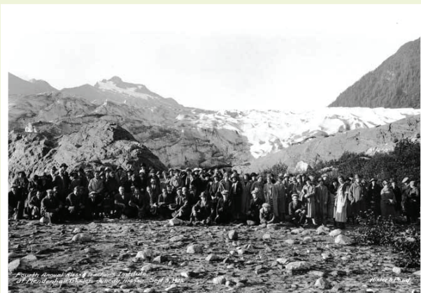
From the State Archives – Alaska Teacher Institute in 1925

"This was a very useful course that had an immediate effect on my teaching... Very good information and practical tips for working in rural schools."