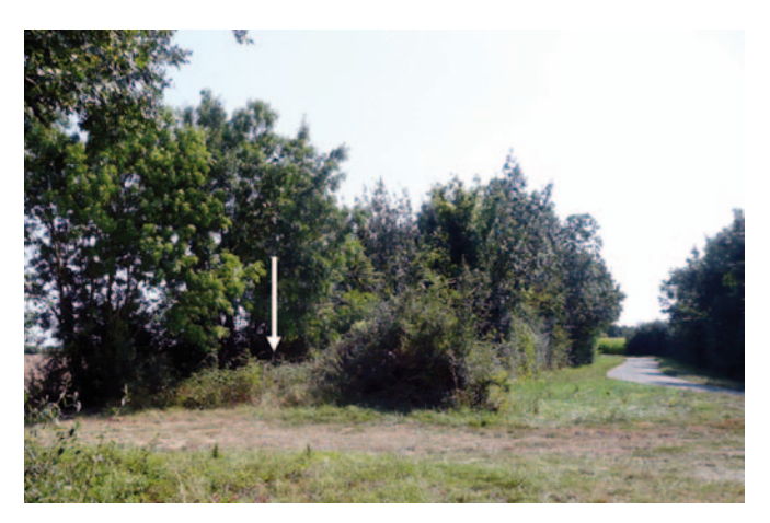
Figure 5. Chasnais hibernaculum with white arrow showing approximate location of the den entrance. The view also illustrates the narrow linear structure of the hedgerow system. Only one viper, a female, was located in the hedgerow to the right in the autumn of 2016 giving birth (Meek, 2016).

European Time (CET) and usually completed within 90 minutes. Detection was made by visual encounter and time of sighting (CET) recorded. Snakes were individually marked by ventral scale-clipping and dorsally painted with a white number allowing the surveyors in the short-term to identify specimens that were already captured without any need for further recaptures.