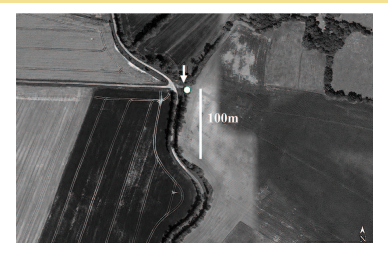
Figure 4. Google Earth map of the study area at Chasnais, western France. Arrow shows location from where the photograph in Fig. 5 was taken and also the direction.