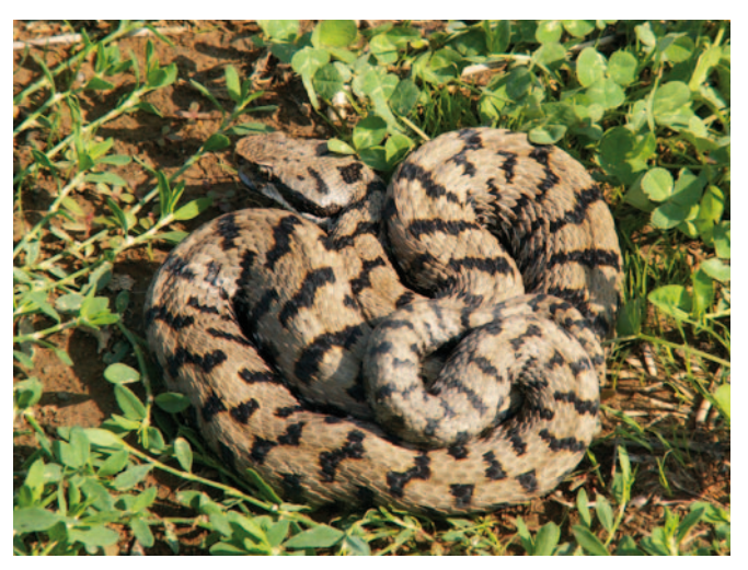
Figure 1. Male of V. aspis from Oriolo Romano (Italy)

The aspic viper (Fig. 1) is widespread in Europe occupying a series of different habitat types (Arnold, 2002; Speybroeck et al., 2017) and in most of its range undergoes winter hibernation, frequently occupying the same winter dens across several years (Meek, 2016; Luiselli et al.,