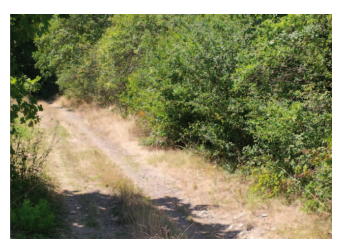
Figure 3. Landscape surrounding hibernaculum A at Oriolo Romano (Italy)

Italy : Observations were made at four hibernation dens (A, B, C, D in Fig. 2) in an area in the Tolfa Mountains north of Rome, Italy (coordinates: 42°19°N, 12°12°E, altitude 387 m; Fig. 2). The four hibernacula were situated in a mixed area of bushy pastures ( Citysus scoparius and Rubus ulmifolius bushes) and oak forest ( Quercus cerris ), thus in a relatively wooded zone although not far from ecotones created by paths and tracks (Fig. 3). Surveying started from February 1987 and continued throughout the active year until November 2017 (30 years of records). Sampling intensity varied substantially across years and seasons: in some years there were 2-3 visits a week 20 February to 05 March but in other years only once a week. Overall, the