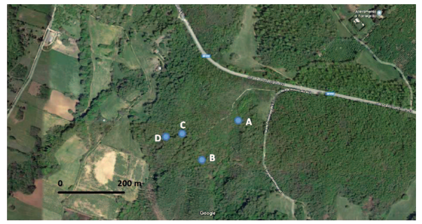
Figure 2. Google Earth map of the study area at Oriolo Romano (Italy), showing the location of the four hibernacula (A, B, C, D)

the mating period (Neumeyer, 1987). Seasonal movements have also been observed in non-viperids, for example, male grass snakes Natrix natrix were more active during the spring than summer although females travelled greater distances during July following oviposition (Madsen, 1984).