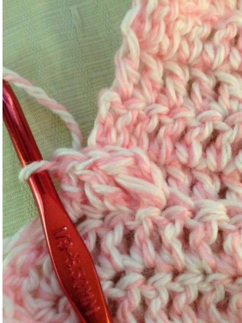
This shows 3 DC stitched at the base of the last petal made.

Row 1: Ch 2, DC in same. 1 DC in base of next 2 DC from Petal 1. (This is the petal overlap that makes the flower part so cute) 1 DC in BLO of next 12 stitches. Ch 2 and turn. (15 DC)