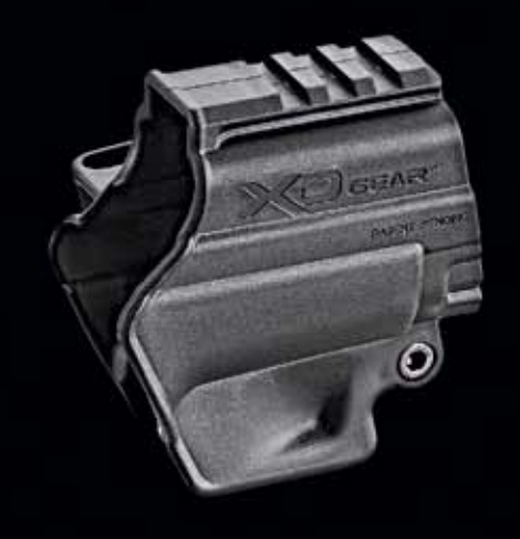
XD GEAR® BELT HOLSTER (US PAT.7290688)