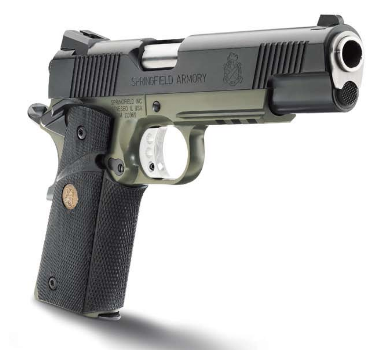
PX9105MLP LOADED MC OPERATOR® OD GREEN ARMORY KOTE™