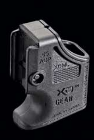
XD GEAR® MAG LOADER (PAT. PEND.)