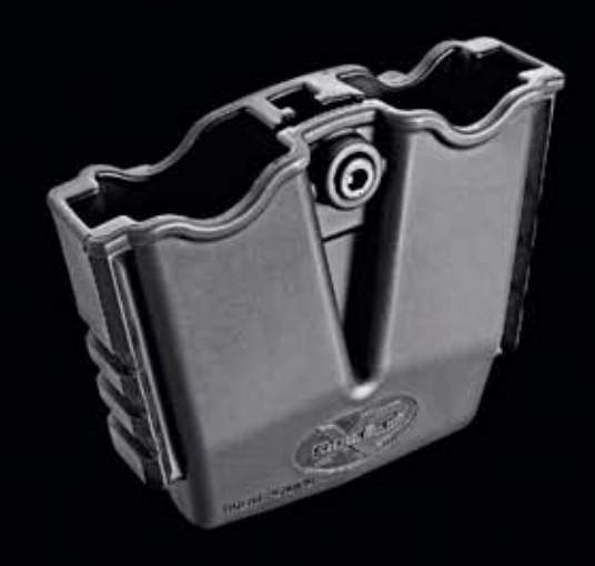
XD GEAR® DOUBLE MAG POUCH (US PAT.7290688)