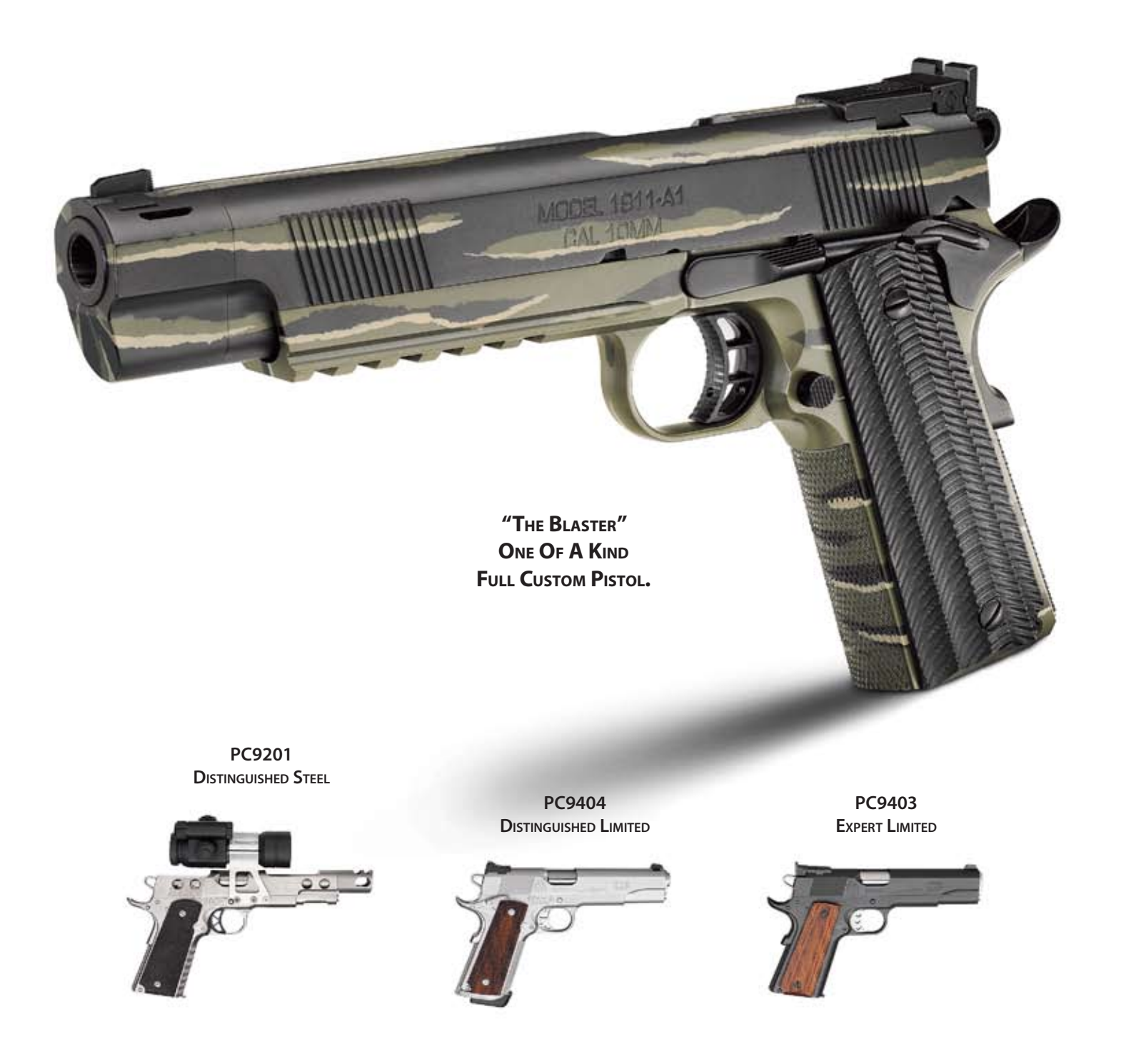
AVAILABLE IN ALL POPULAR 1911-A1 CALIBERS BUILT TO INDIVIDUAL SPECIFICATIONS.